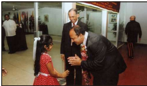
Welcoming the Chief Guest Hon. Neomal Perera - Deputy Minister of External Affairs

The SAARC Cultural Centre celebrated the 25th anniversary of the South Asian Association for Regional Cooperation (SAARC) on Wednesday 8th December 2010. A reception was organized for invitees at the Sri Lanka Foundation Institute, Colombo 7, Sri Lanka.