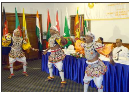
A Sri Lankan ritual dance at the inauguration of the Seminar

The three day Seminar on Rituals, Ethics and Societal Stability that was held in Colombo, Sri Lanka from 23 to 25 September 2010, marked the first event organized by the SAARC Cultural Centre. Inauguration