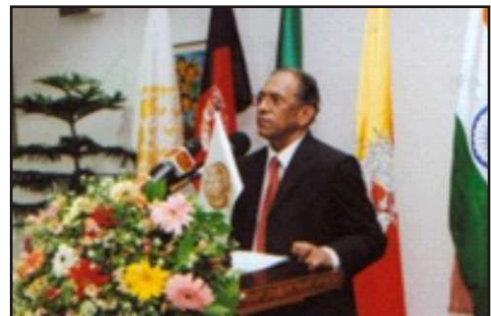
Director of SAARC Cultural Centre addressing the inauguration