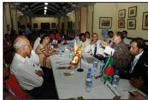
Workshop session in progress

The Workshop on Shared Heritage of Sculpture and Decorative Arts in South Asia was held from 27 January 2011 to 29 January 2011 at the National Art Gallery, Colombo, Sri Lanka. Objectives of the Workshop were, to present the elements of sculpture and decorative arts in the respective country; to review the characteristics of best elements in the shared regional culture; and to find strategic approaches to promote and preserve shared heritage of sculpture and decorative arts. Distinctive delegates representing Bangladesh, Bhutan, India,