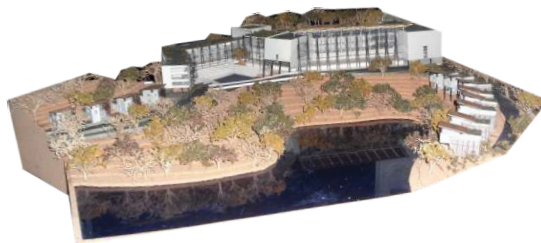
Proposed SAARC Cultural Centre complex in Matara

In order to promote the distinguished Art of South Asia, it has been decided at the 10th SAARC Summit held in Colombo to establish a South Asia Cultural Center in Sri Lanka. This was a decision taken in recognition of the need to share, preserve and promote the rich and diverse intangible and oral cultural heritage of South Asia which has its roots spanning over thousands of years.