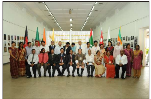
Group photo of the participants of the Symposium