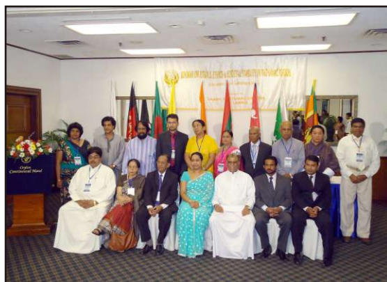
Group photo of the participants of the Seminar

This seminar was the first event in a series of events that have been organized by the Centre in an attempt to bring member states of the SAARC region together embracing culture and recognizing unity through diversity.