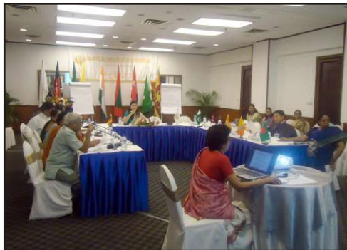
Working session of the Seminar

As an outcome of the Seminar, a Plan of Action was developed by the delegates of the Seminar, considering the need to maximize rituals and ethics and the challenges in protecting it.