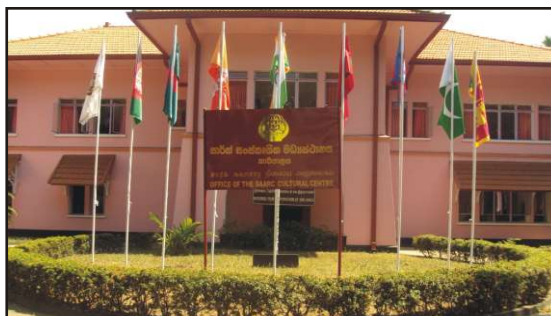
SAARC Cultural Centre project office in Colombo

On this background SriLankan Government has opened the SAARC Cultural Centre in Colombo on 25 March 2009, while taking necessary arrangements to complete the construction work of the buildings in Matara down South Sri Lanka.