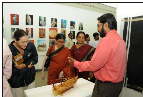
Maldives delegate explaining an exhibit to visitors