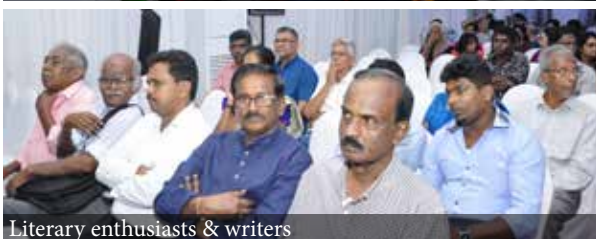
Literary enthusiasts & writers