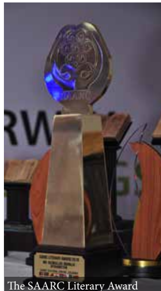
The SAARC Literary Award