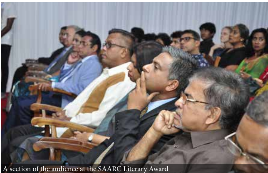
A section of the audience at the SAARC Literary Award