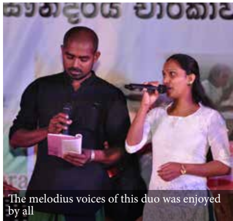
The melodius voices of this duo was enjoyed by all