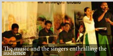
The music and the singers entralling the audience

In 2018, The SAARC Cultural Centre celebrated the SAARC International Women's Day in collaboration with the Department of Cultural Affairs in Sri Lanka on the 8 th of March 2018, at the Auditorium of the District Secretariat in Kalutara. "A Mother's Song: An aesthetic journey through South Asia in search of the Rhythms of love" was the SAARC title on Women's Day and the program was designed to communicate solutions to societal evils through the medium of music and song. The auditorium