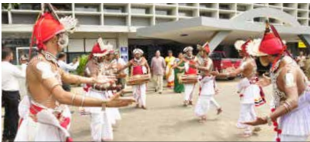
Traditional drummers & dancers ceremonially leading the Chief Guest & Guests of Honor to the Auditorium