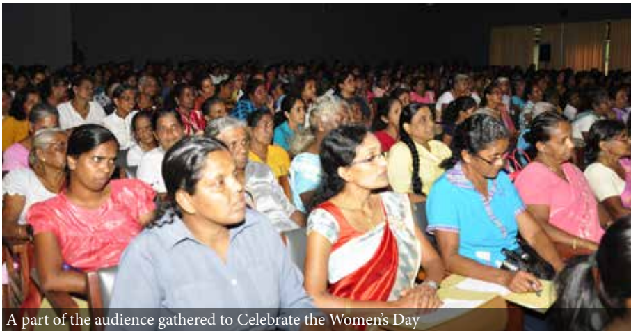
A part of the audience gathered to Celebrate the Women's Day