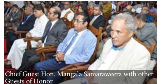
Chief Guest Hon. Mangala Samaraweera with other Guests of Honor

areas of literature in the Regional and International arenas. The SAARC Literary Award will be presented alphabetically to a writer from each Member State, commencing with Afghanistan for 2018.