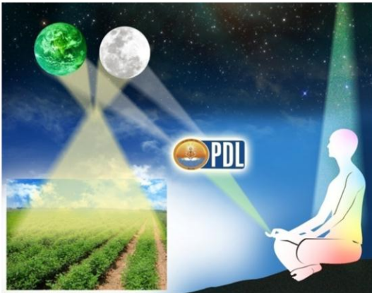
Figure 4: Energy Channel doing the Healing

energy development and therapy course. In this course, the individual is initiated into energy and given the process, practicing which regularly, the individual can increase extra sensory capabilities to be able to connect with higher planes of consciousness and draw subtler levels of cosmic energy.