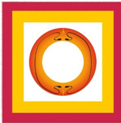
Figure 2: Top End View of the Earthen Structure used for Generation of Heat Energy

This process is described in Atharveda as Vedic Organic Agriculture. Agni is the fire element which contains Space and Air elements as well. This technique is used for preparing the optimal environment for the germination and development of seed by maintaining the temperature and purification of the environment. It is conducted a day before sowing the seed. The heat generation is carried out by lighting fire in a specially designed earthen structure shown in Fig. 2 .