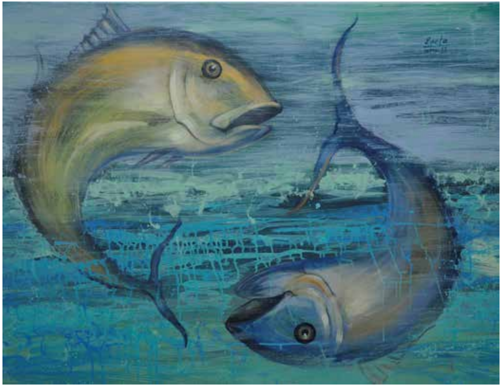
Untitled, Reeta Manandhar, Oil on Canvas, 36" x 48"