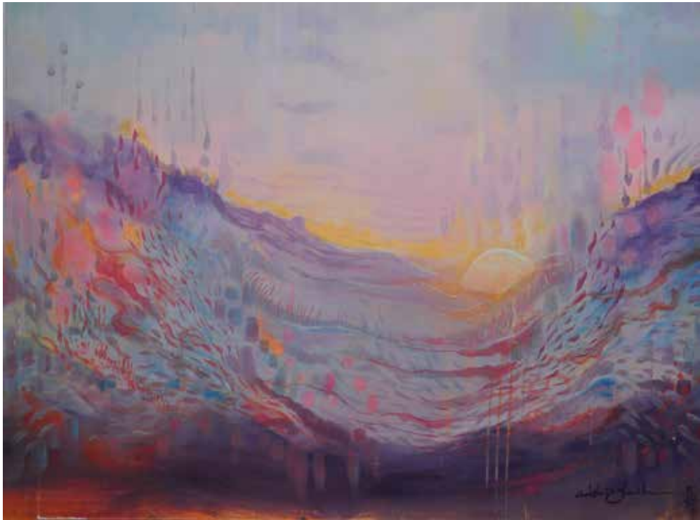
Untitled, Aishath Shuaila Rasheed, Oil on Canvas, 35" x 47"