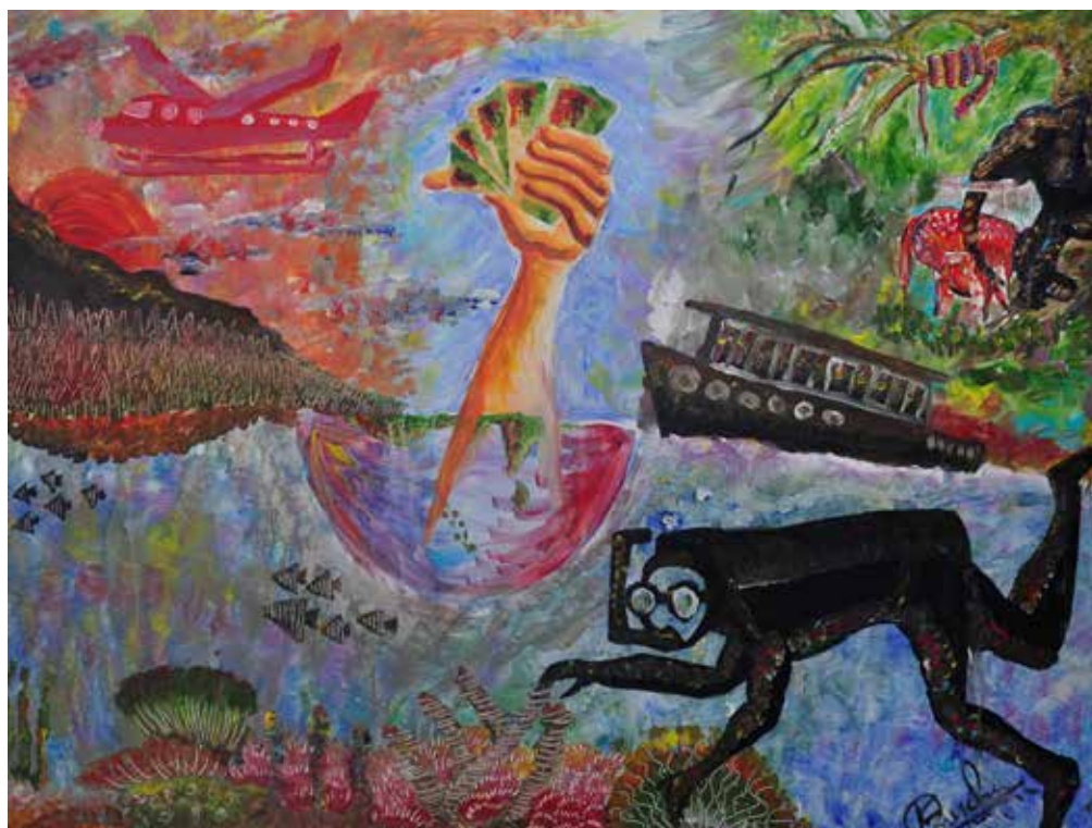
Oceans a binding treasure of South Asia, Garuka Priyashan Wellala, Oil on Canvas, 36" x 48"