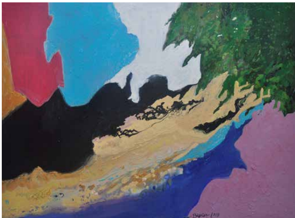
Untitled , Bipin Kumar Ghimire, Oil on Canvas, 35" x 47"