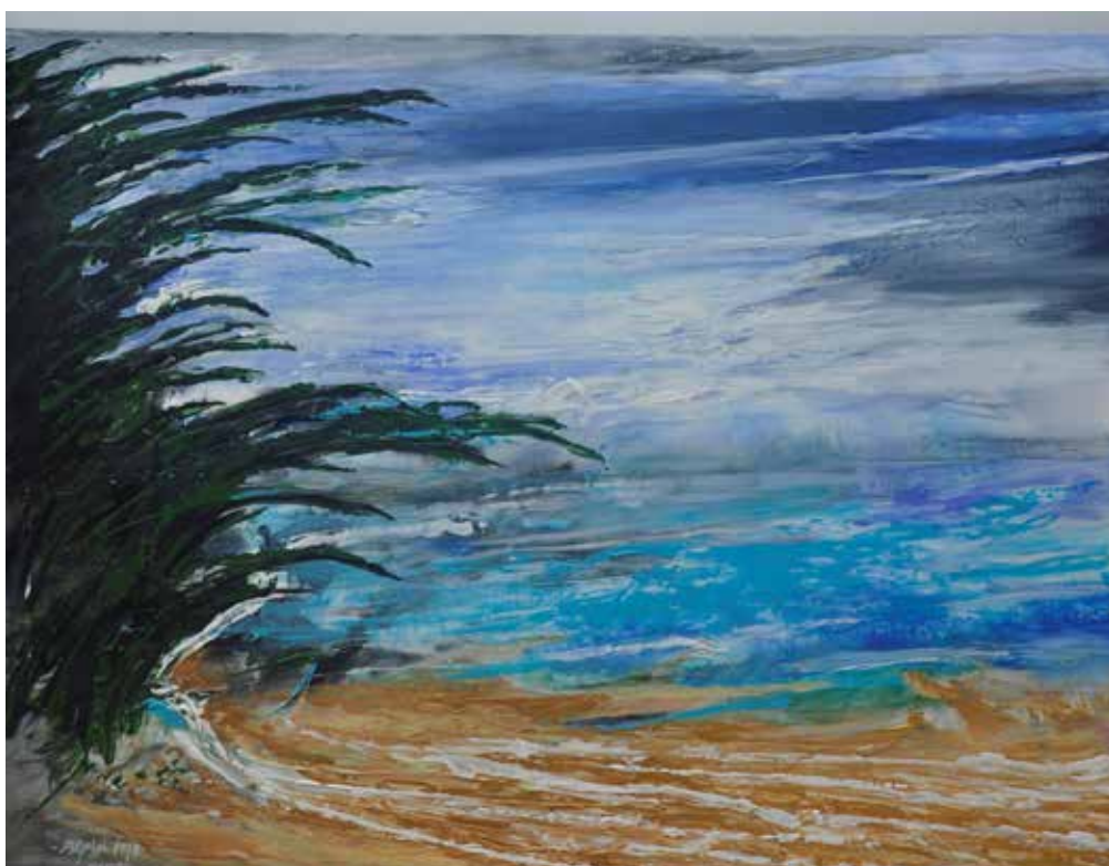
Untitled , Bipin Kumar Ghimire, Oil on Canvas, 36" x 48"