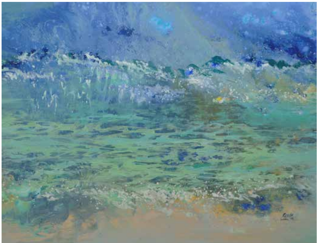
Untitled, Reeta Manandhar, Oil on Canvas, 36" x 48"