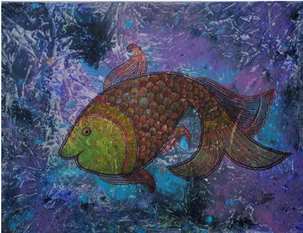
Untitled, Ranju Kumari Yadav, Oil on Canvas, 35" x 47"