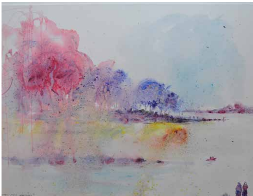
Untitled, Jampel Cheda, Oil on Canvas, 36" x 48"