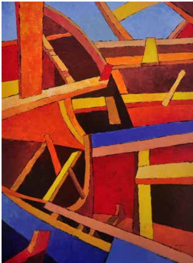
Untitled, Ahmed Amir, Oil on Canvas, 35" x 47"