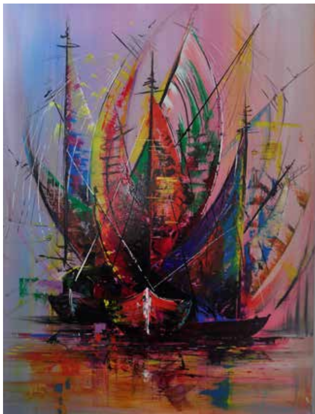
Untitled, Ibrahim Shaheen, Oil on Canvas, 35" x 47"