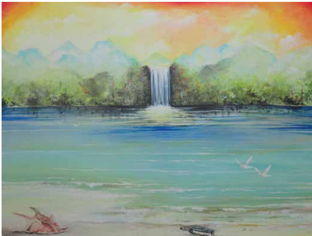
Untitled, Ali Amir, Oil on Canvas, 36" x 48"