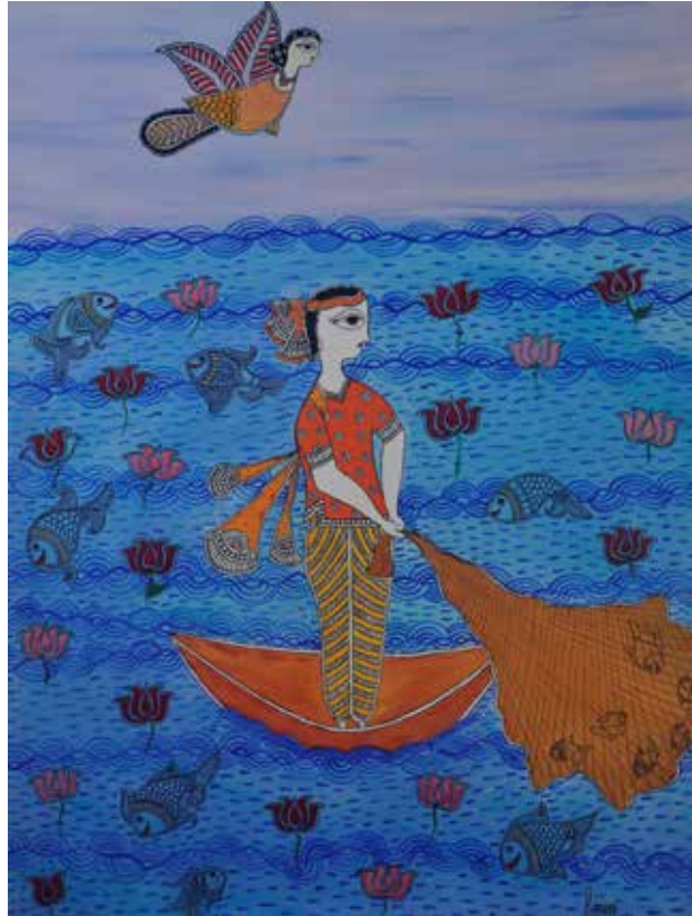
Untitled, Ranju Kumari Yadav, Oil on Canvas, 36" x 48"