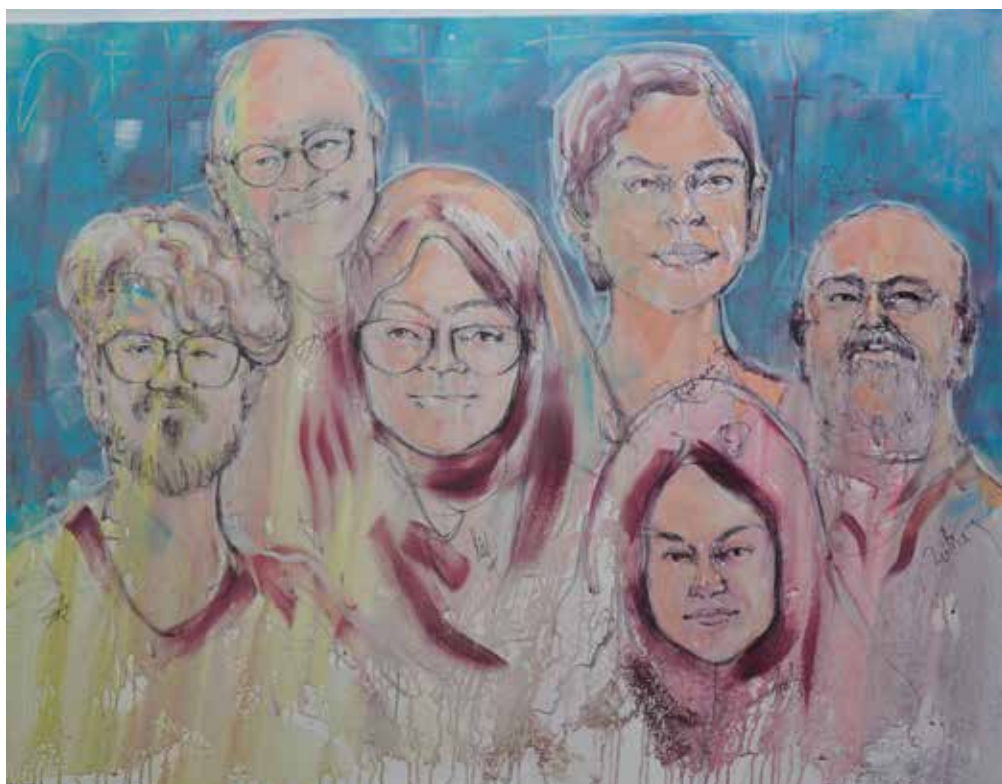
Untitled, Jampel Cheda, Oil on Canvas, 35" x 47"