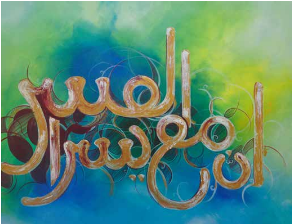
Untitled, Maimoona, Oil on Canvas, 35" x 47"