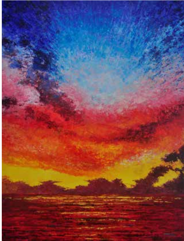
Untitled, Ahmed Amir, Oil on Canvas, 35" x 47"