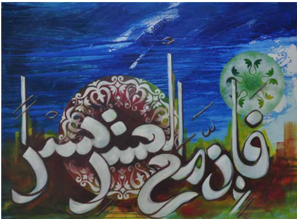
Untitled, Maimoona, Oil on Canvas, 35" x 47"