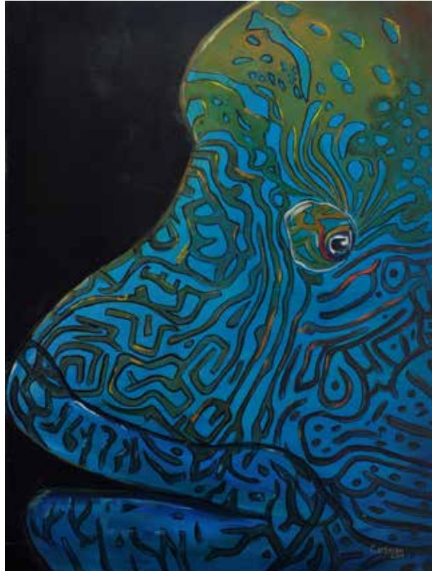
Maahulhunbu landaa (Napoleon wrasse), Ali Rishwaan, Oil on Canvas, 35" x 47"