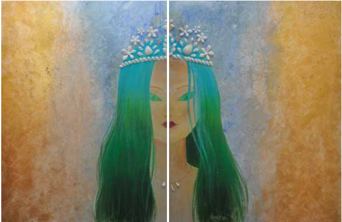
Untitled, Kunzang Wangmo, Mixed Media, 36" x 48" (2 pieces)