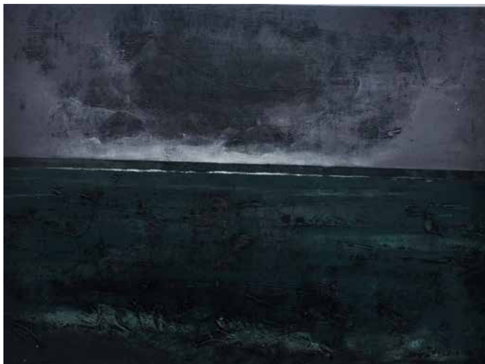
Just the moment Hulhumale, Md. Tarikat Islam, Acrylic on Canvas, 36" x 48"