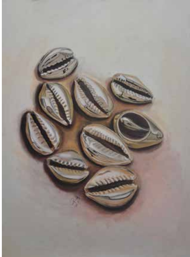
Untitled, Ali Fathuhee, Oil on Canvas, 36" x 48"