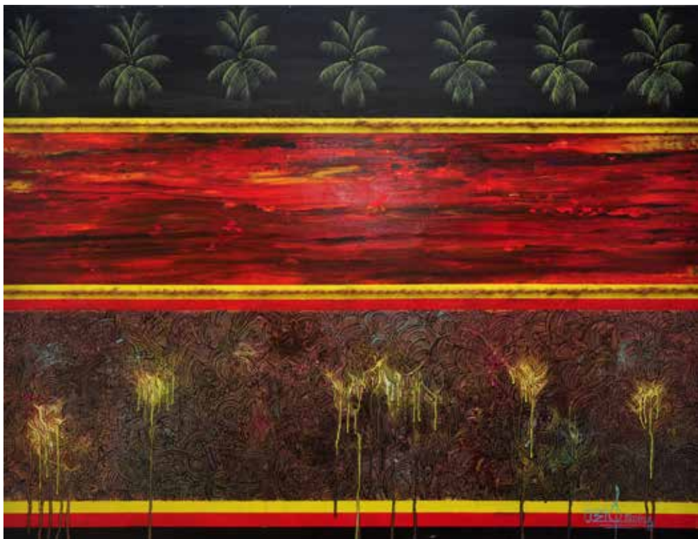
Untitled, Ibrahim Shaheen, Oil on Canvas, 35" x 47"