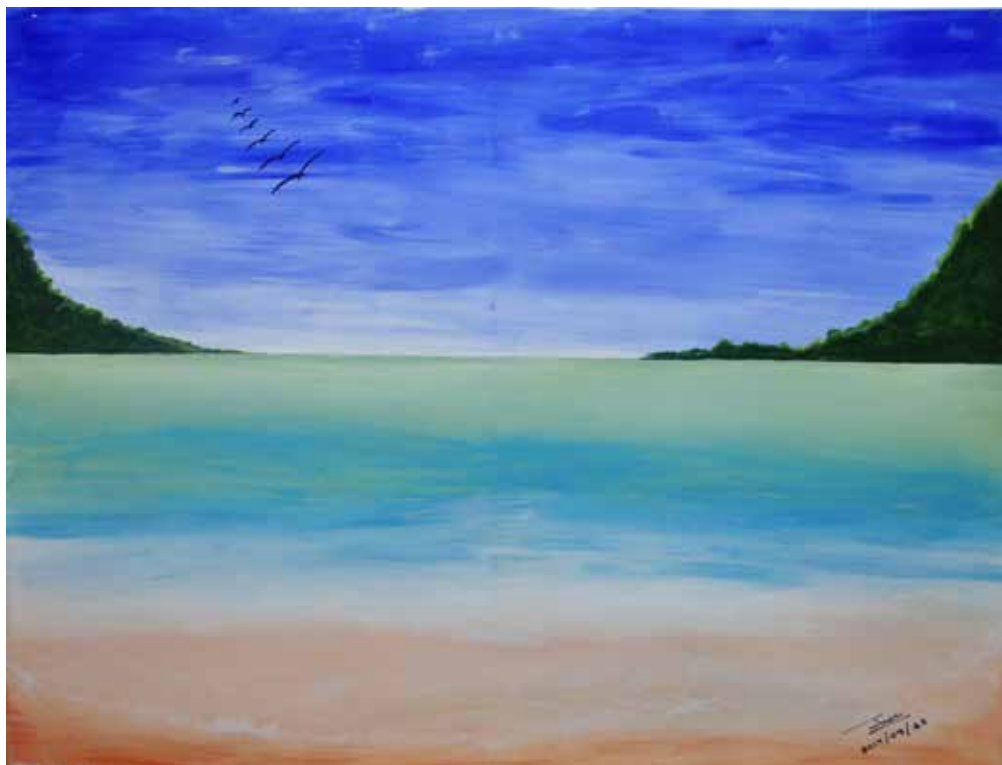
Blue Ocean , T.D.S. Gayaan Priyangana, Oil on Canvas, 35" x 47"