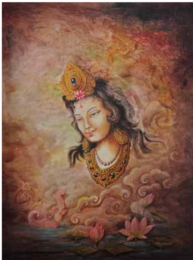
Untitled, Sundar Sinkhwal, Oil on Canvas, 36" x 48"