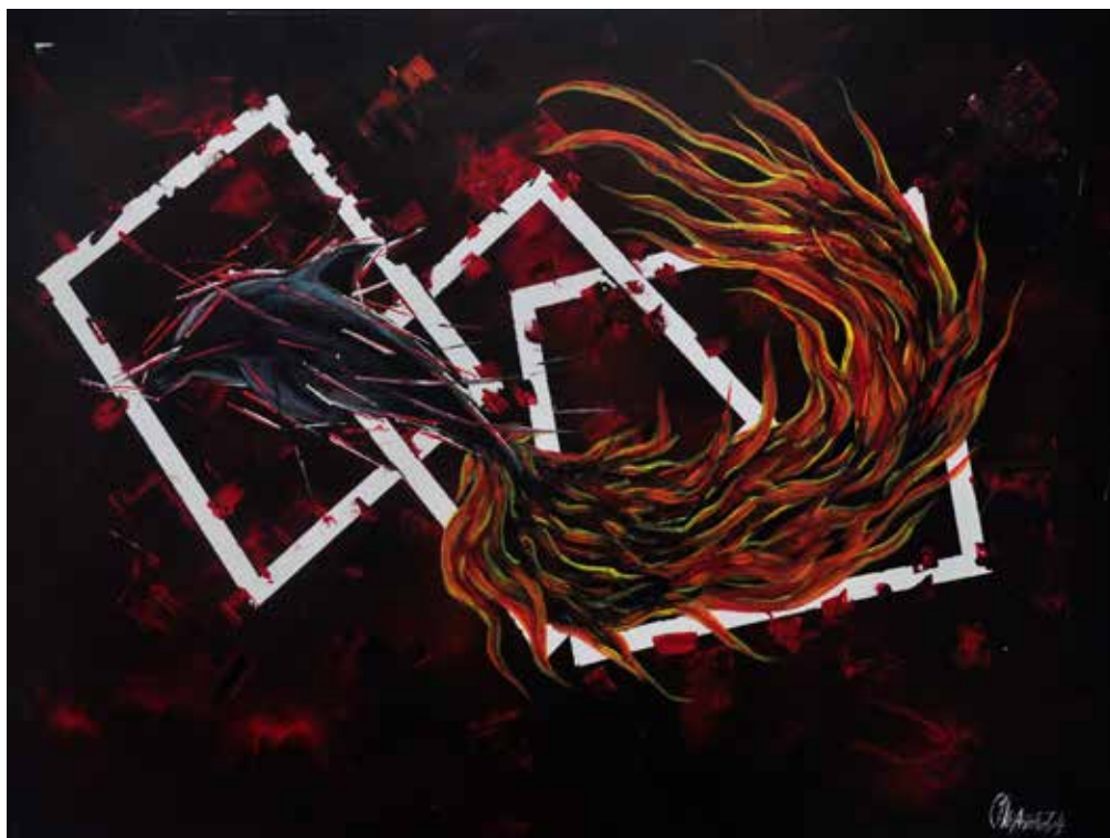
Untitled, Ahmed Ihsaan Oil on Canvas, 35" x 47"