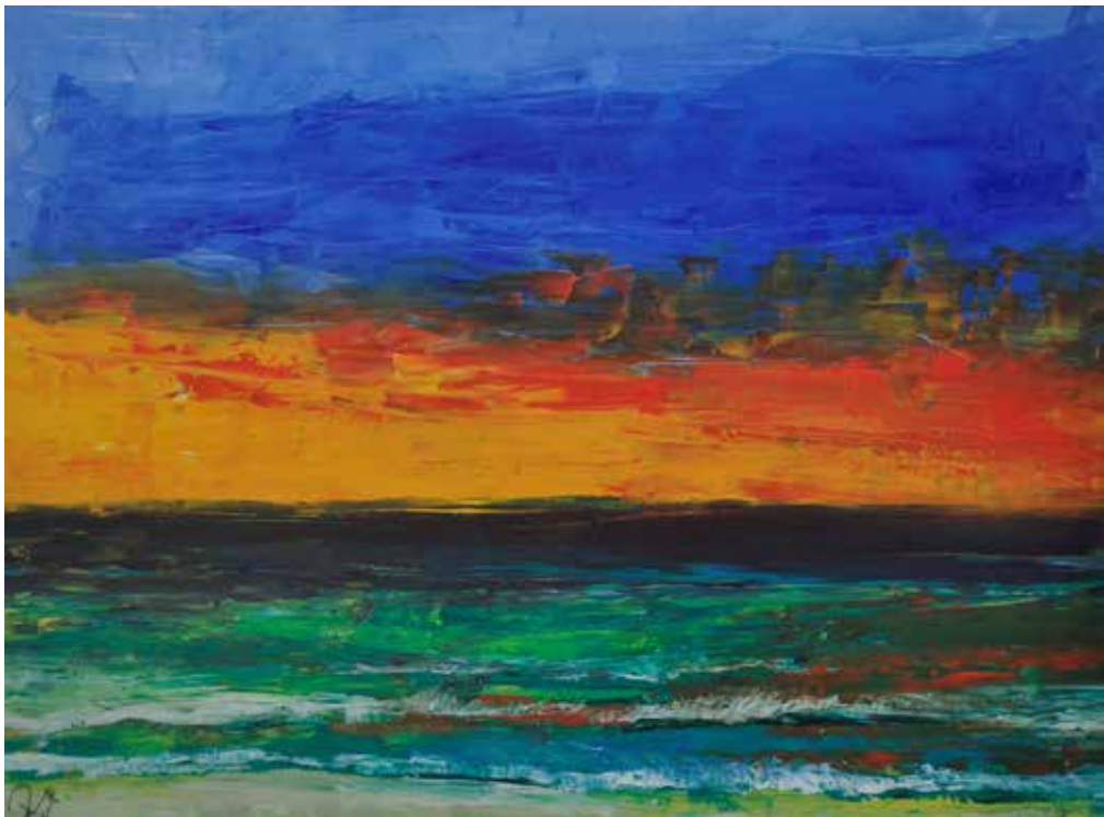
Untitled, Ali Fathuhee, Oil on Canvas, 35" x 47"