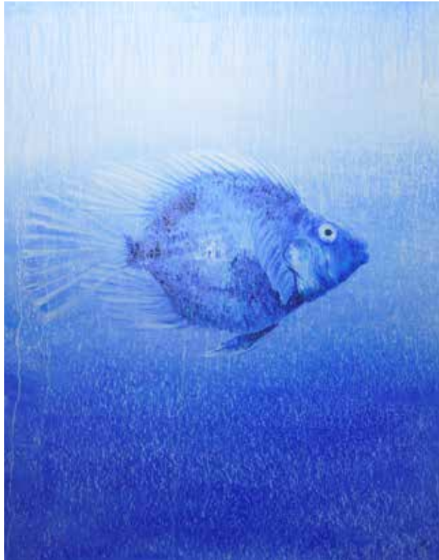
Untitled, Musthafa Mohamed, Oil on Canvas, 36" x 48"