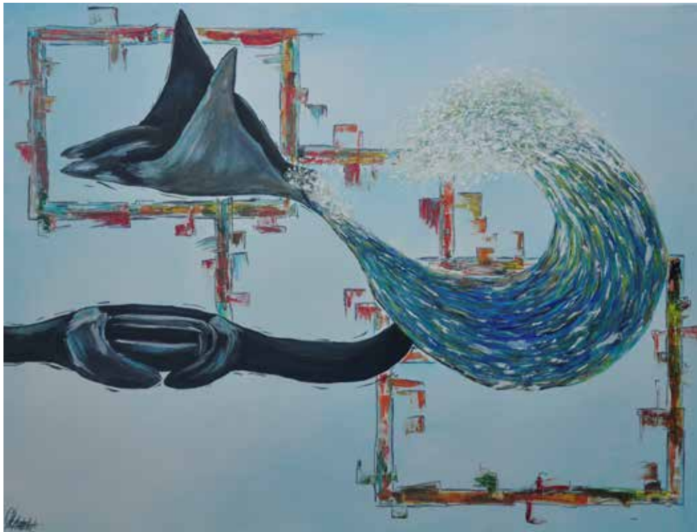
Untitled, Ahmed Ihsaan, Oil on Canvas, 35" x 47"