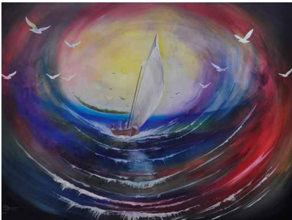
Untitled, Ali Amir, Oil on Canvas, 35" x 47"