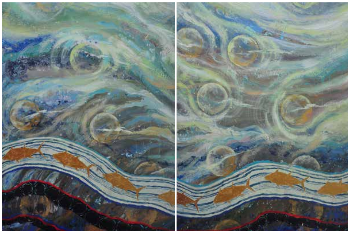
Oceans binding Treasure, Took Bahadur Thapa, Oil on Canvas, 36" x 48" (2 pieces)