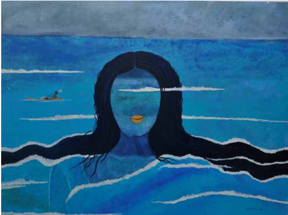
Power in Beauty , Shulekha Chaudhury, Oil on Canvas, 35" x 47"