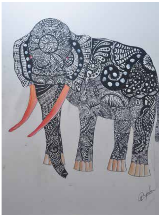
Untitled, Garuka Priyashan Wellala, Oil on Canvas, 36" x 48"