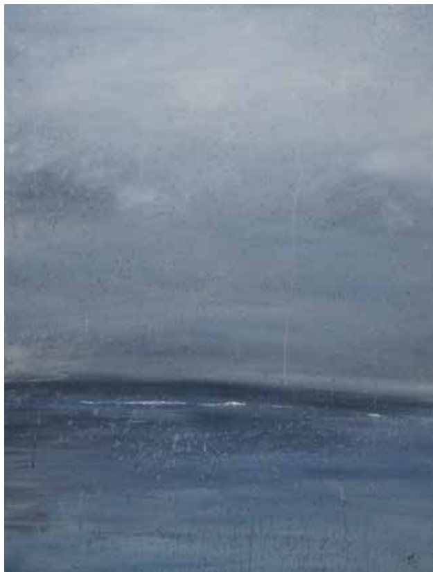
Untitled, Musthafa Mohamed, Oil on Canvas, 35" x 47"