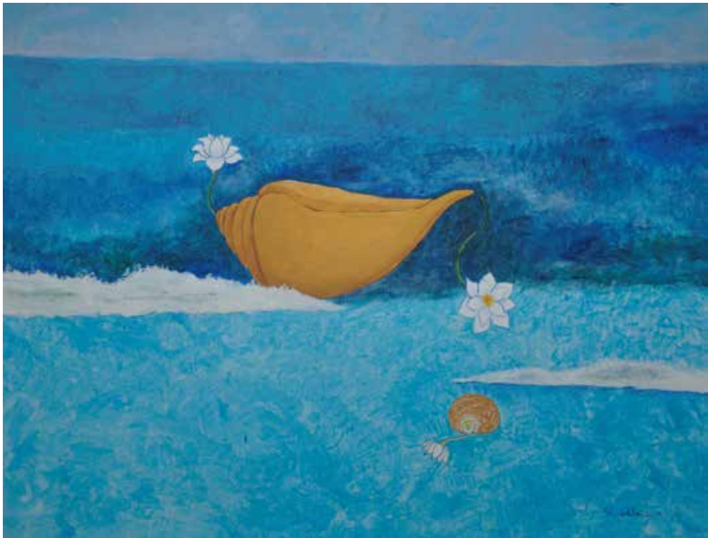
Power in beauty (ii) , Shulekha Chaudhury, Oil on Canvas, 35" x 47"