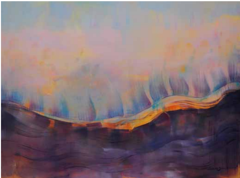
Untitled, Aishath Shuaila Rasheed, Oil on Canvas, 36" x 48"