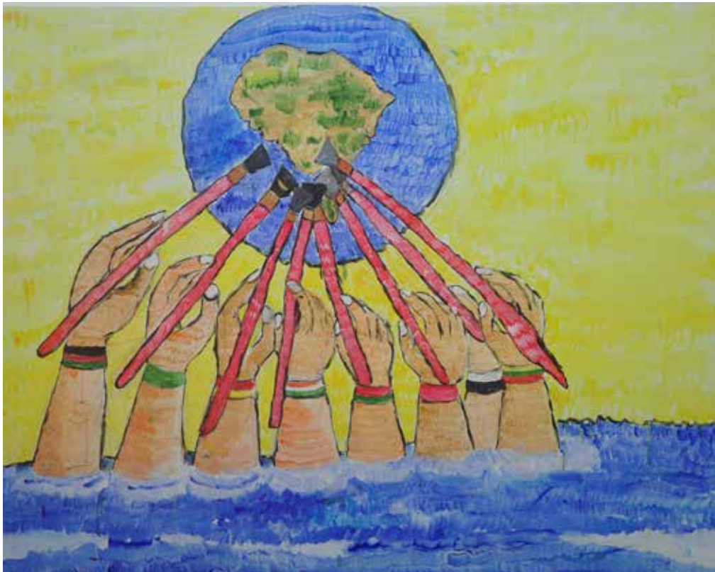
Oceans, A binding treasure of South Asia, Upadhyaya Mashal Ilangarathna, Oil on Canvas, 36" x 48"