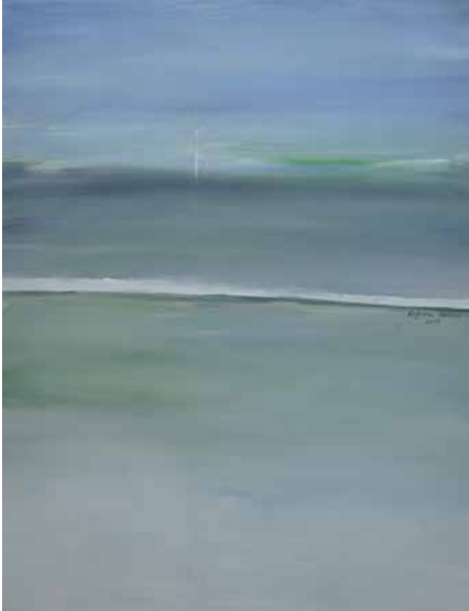
Sea Beach 2019, Najma Akther, Acrylic on Canvas, 35" x 47"