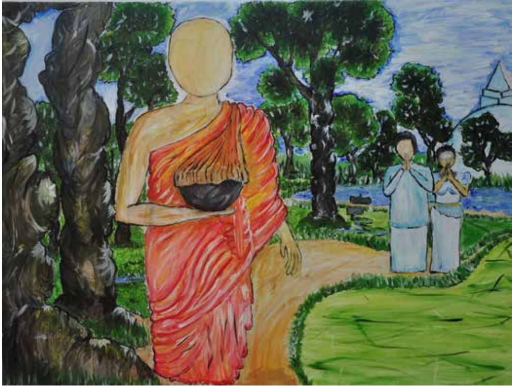
Untitled, Upadhyaya Mashal Ilangarathna, Oil on Canvas, 35" x 47"