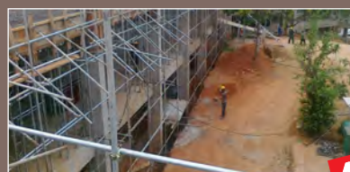
Construction Site, Matara