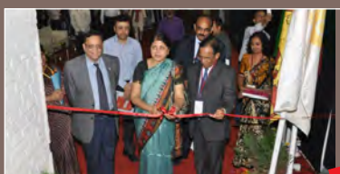
"Wheel of Life"