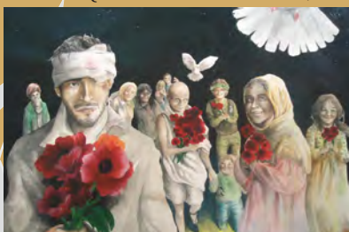
Hui Gyeong Song Colombo International School, Colombo