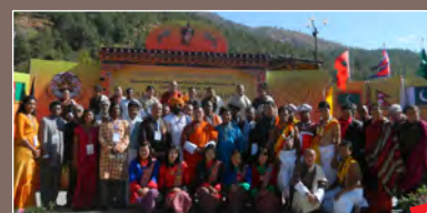
Traditional Drumming in South Asia