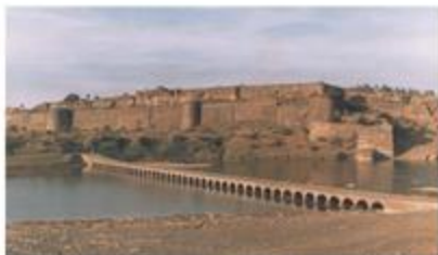
Amber (Amer) Fort, Jaipur