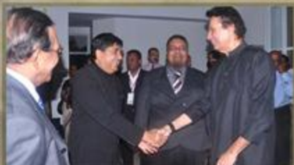
SAARC Film Festival 2013