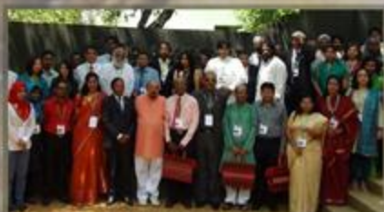
Regional Seminar on TK & TCE