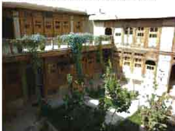
Project name: The Great Serai Location: Kabul, Afghanistan