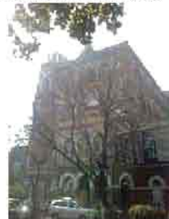
Project Name: Royal Bombay Yacht Club Residential Chambers Location: Mumbai, India