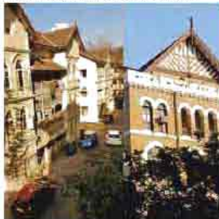
Project name: Lal Chimney Compound Location: Mumbai, India