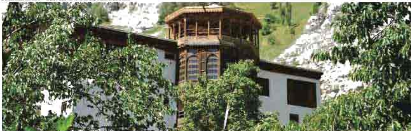
Project name: Khaplu Palace | Location: Baltistan, Pakistan