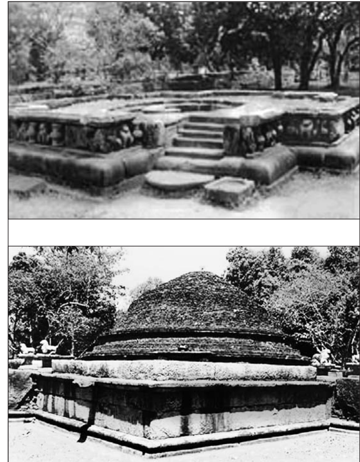
Figure 1 (a and b): Magul Poruwa at Magul Maha Vihara at Lahugala in the Ampara district

Among the Buddhists in Sri Lanka the Poruwa ceremony holds an important place in a marriage due to numerous cultural implications and obligations. It is assumed that the history of the Poruwa goes back as far as two thousand years. There is the decorated granite Magul Poruwa , (a temporary stage erected to perform marriage rituals of the couple that is going to be wed), in the Magul Maha Vihara at Lahugala in Ampara district in Sri Lanka (Figure 1). The historical belief is that this was used during the marriage of King Kawantissa of Ruhuna and Vihara Maha Devi, the parents of the well-known Sinhala King Dutugemunu (161-137 BC).