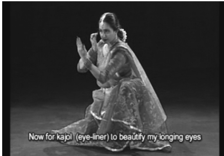
Figure 3: Applying collyrium in the Indian dance item Kathak .