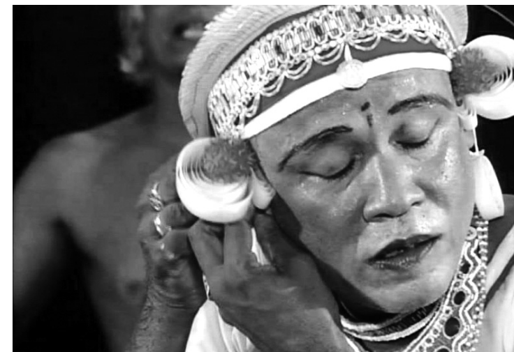
Figure 2: Putting on earrings in the Sri Lankan Low Country culture ritual ( Shanthikarma ) “ Ratayakuma ” in Nanumuraya