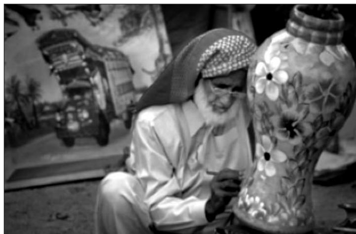
Figure 3: The old man wearing Pakistani Shalwar Kamiz is painting a vase in predominantly Iranian-influenced style, wearing a head-scarf worn by men in Middle-East, represents diverse influences and affiliations of the Pakistani population with its neighbours and beyond.