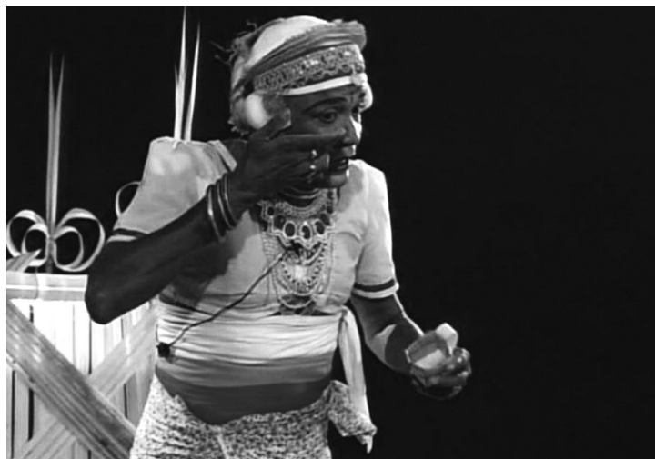
Figure 4: Applying collyrium in the Sri Lankan LowCountry culture ritual ( Shanthikarma ) “ Ratayakuma ” in Nanumuraya