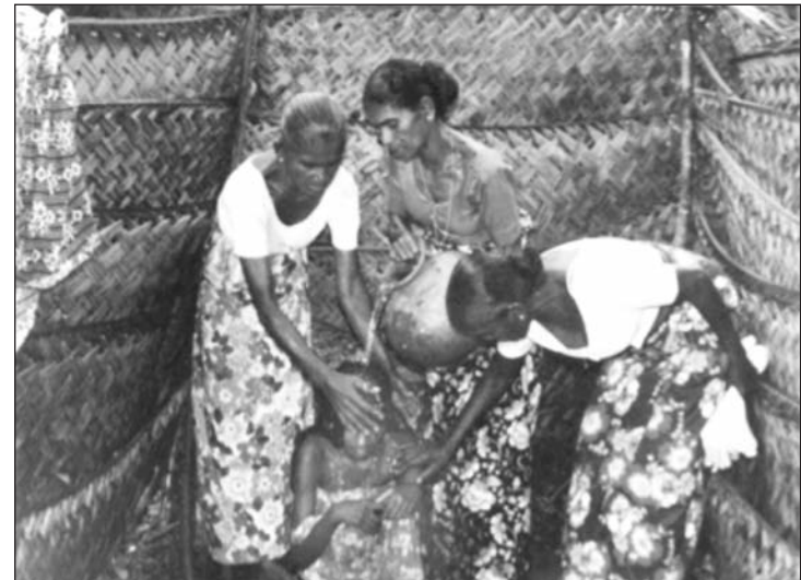
Figure 1: First bathing after puberty

evident in the annals of their history. This custom which is followed to make the physically matured girl to become mentally matured consists of many features. The main objective of all these features is to instill in the girl who has attained puberty, the discipline and restraint while establishing her in the society with a new identity. Through all these customs pertaining to puberty, the girl is socialised by subjecting her to various procedures and techniques leading to play her future role as a woman, wife and mother. Sinhala people refer to these grand celebrations leading to the girl being taken out of doors as Kotahalu Mangalya .