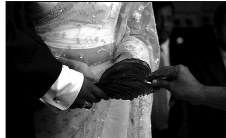
Figure 5: Offering betel leaves to pay gratitude to the future mother-in-law

The Poruwa ceremony ends with offering betel leaves to the elders, relatives and the kin of both parties (Figure 5).