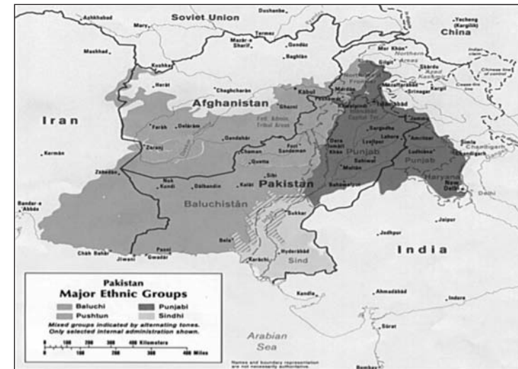
Figure 1: Pakistan : Major Ethnic Groups

Pakistan has thus, overlapping cultural and linguistic identities, meaning, affinities with its borders, and yet a larger religious identity with similarities beyond its borders. I would make my argument by saying that the cultural and linguistic similarity between Punjab of Pakistan and Punjab of India, shared traditional heritage and Pushtoo language of Khyber-Pakhtoonkhwa and Afghanistan, tribal mores and culture of Baluchistan and Iran make Pakistan a key jigsaw piece in the South Asian region, as evident from the map shown in Figure 1: