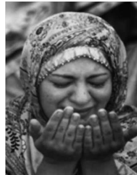
Figure 2: A young girl attired in Shalwar Kamiz, the national dress of Pakistan, but also popularly worn in Indian Punjab makes it difficult to guess if she is a Pakistani or an Indian.