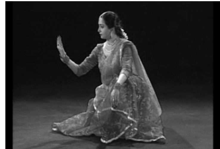
Figure 5: Looking in the mirror in the Indian dance item Kathak .