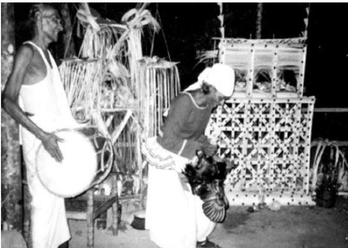
Figure 2: Savul Paliya Offering of the Ritual Rooster