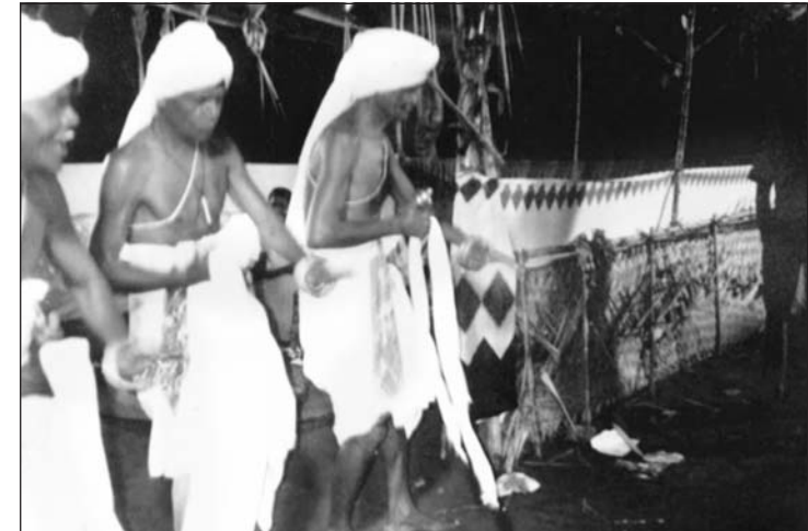
Figure 3: The shamans performing the blessing, wearing the wendama and the hand bangles.

Shamans (exorcists), the girl who has attained puberty and the two blessing women enter the hut in an orderly fashion. Chief shaman and the other four