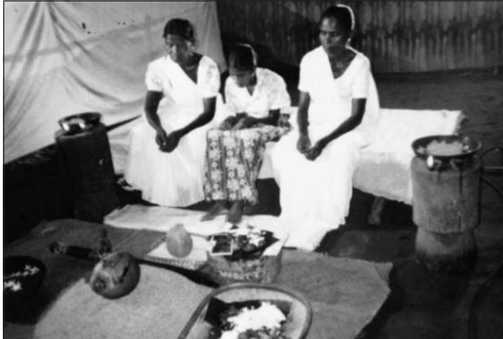
Figure 4: The two wooden mortars with lighted oil lamps on either side of the girl.