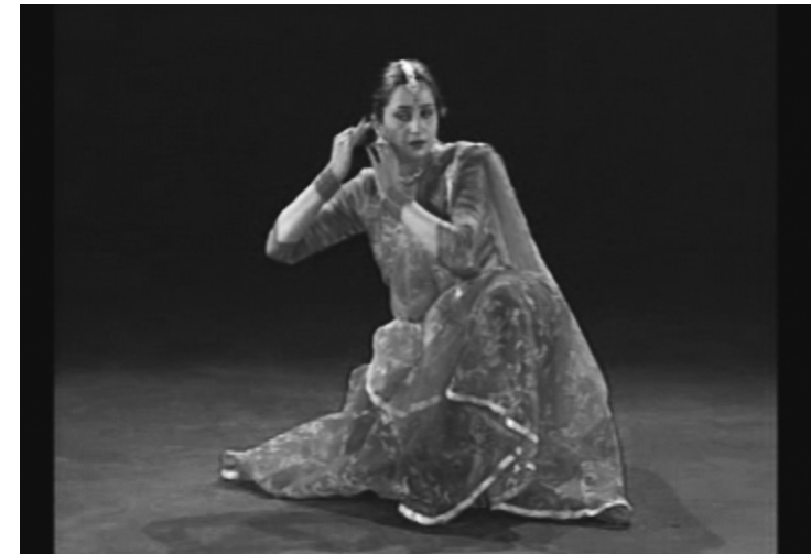
Figure 1: Putting on earrings in the Indian dance item Kathak .

It is common for Indian women to apply kohl on their eyelids. Although such an activity is not popular