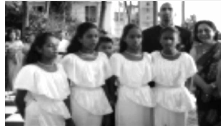
Figure 3: The recital of ' Jayamangala gatha ' (benedictory verses)

As the couple is mounted on the Poruwa ' ashtaka ' (stanzas recited at the Poruwa ) is recited by the proficient elders to invoke the blessings of the gods and any other super-human or non-human powers to the newly wedded couple. In many cases two elderly males represent both sides in doing this. These ashtaka are not only to invoke the blessings of the divine realm but also to avoid the 'evil eye' and 'evil mouth' of the people and to minimise the influences of the malicious planets. So all in all these ' jayamangala gatha ' (benedictory verses) are sung or recited to make the future life of the couple less troublesome (Figure 3).