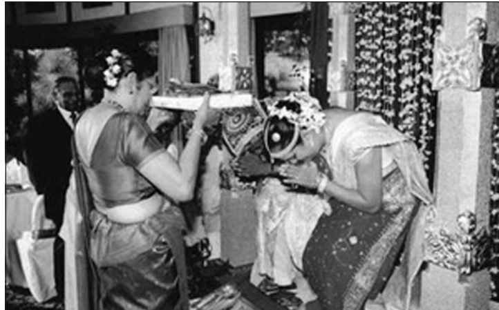
Figure 4: Offering of redi kachchi (40 yards of white cloth)