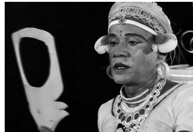
Figure 6: Looking in the mirror in the Sri Lankan LowCountry Culture ritual ( Shanthikarma ) “ Ratayakuma ” in Nanumuraya