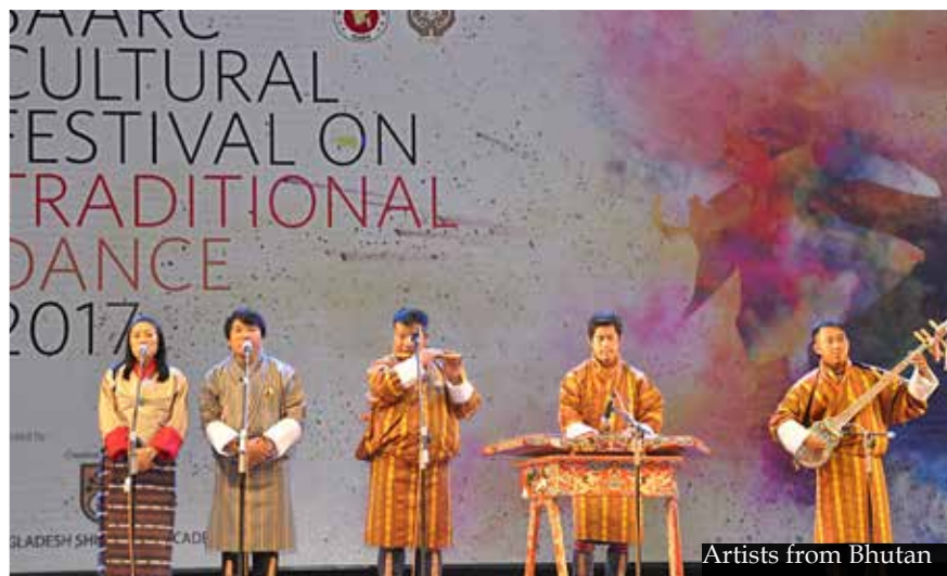
Artists from Bhutan

The primary aim of the Workshop component of the Programme was to create something unique and diverse but which is inherently familiar. To create something beautiful which the dancers could take back to their own countries and to share that artistic experience through dance and music. Every morning, the dancers would gather and use their creativity, knowledge and technique to choreograph an entirely new dance that incorporated all the main features of each traditional dance from the respective Member State.