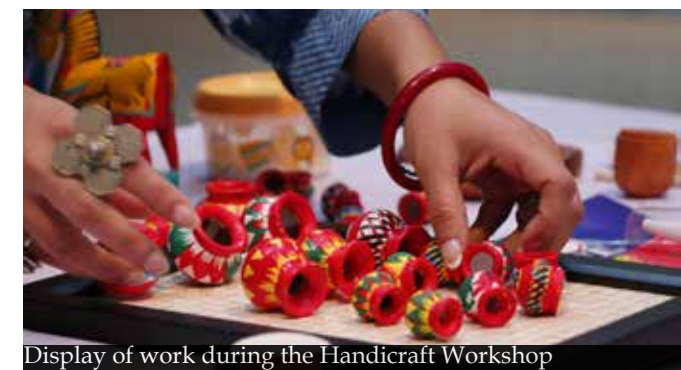
Display of work during the Handicraft Workshop