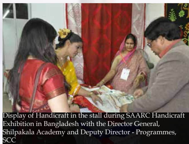
Display of Handicraft in the stall during SAARC Handicraft Exhibition in Bangladesh with the Director General, Shilpakala Academy and Deputy Director - Programmes, SCC