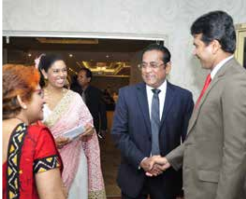
Director and Deputy Directors welcoming the representative from the Pakistan High Commission in Sri Lanka