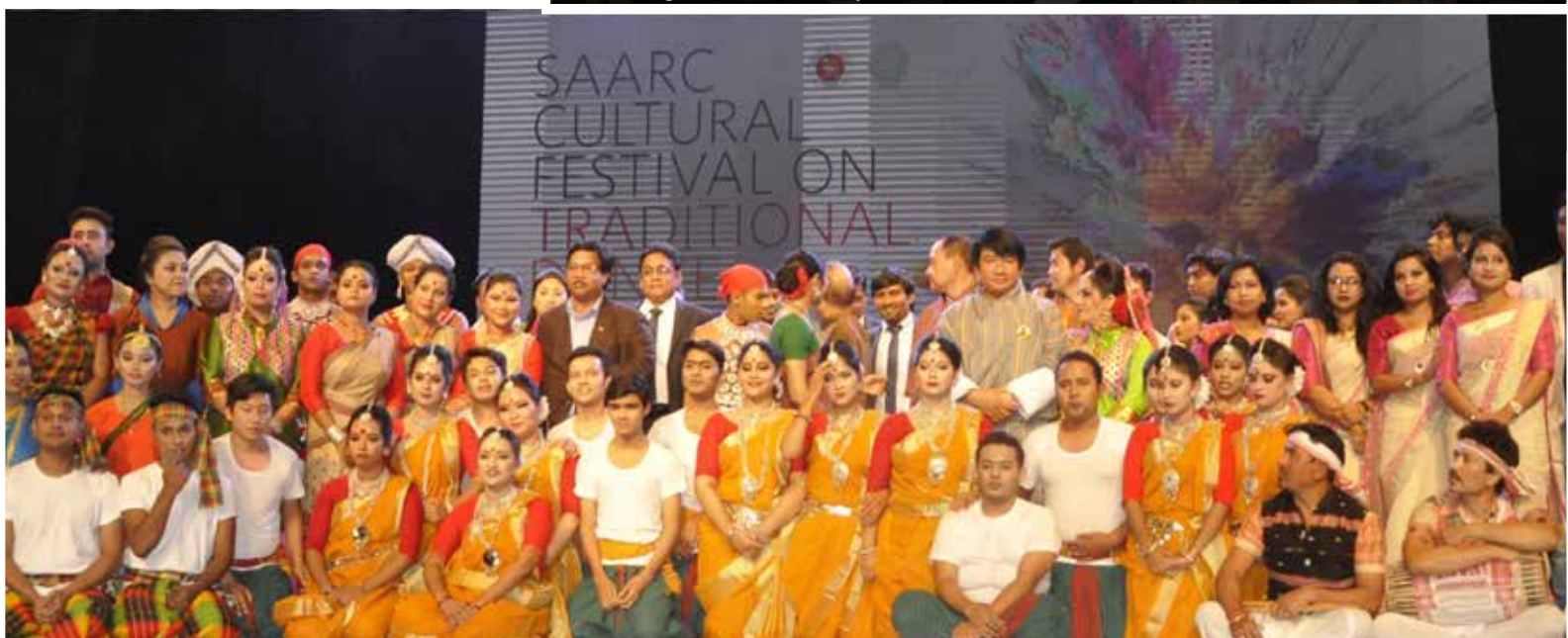
Performers during the Closing Ceremony of the SAARC Traditional Dance Festival with the Director, SCC, the Cultural Minister of Bangladesh and the Director of Shilpa Kala Academy