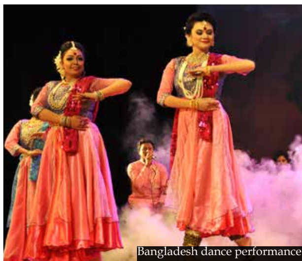
Bangladesh dance performance