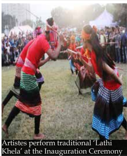
Artistes perform traditional 'Lathi Khela' at the Inauguration Ceremony