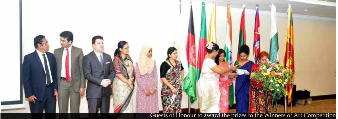
Guests of Honour to award the prizes to the Winners of Art Competition

The Non-Violence Day Art Competition for students across the island was held for the sixth consecutive year. The competition was held under two categories with the themes “Non-Violence is goodwill towards all life” for the Junior Category and “An eye for an eye makes the whole world blind” for the Senior Category. The aim was to create awareness and inspire peace, tolerance, non-discrimination, co-existence and respect for lives among the students. Students from all 9 provinces of Sri Lanka participated in the competition with Ilma International Girl’s school of Colombo submitting the most number of paintings followed by Kadayamottai Muslim Central collage, Madurankuliya of Putlam District winning the second place and Yashodara Girl’s College in Colombo taking the third place. The Award Ceremony was held at Hotel Galadari to coincide with the SAARC Charter Day on 8 th December 2017.