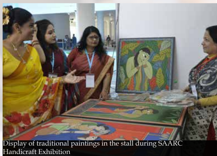
Display of traditional paintings in the stall during SAARC Handicraft Exhibition