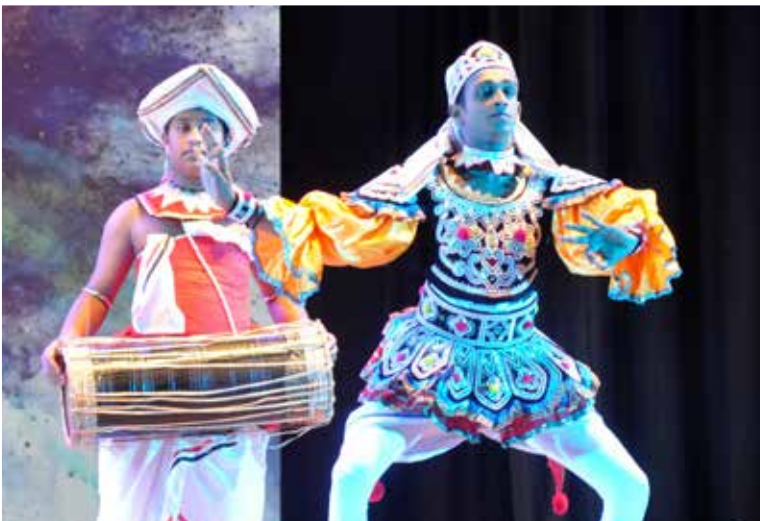
Artists from Sri Lanka performing a traditional dance item