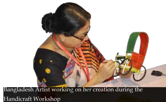
Bangladesh Artist working on her creation during the Handicraft Workshop