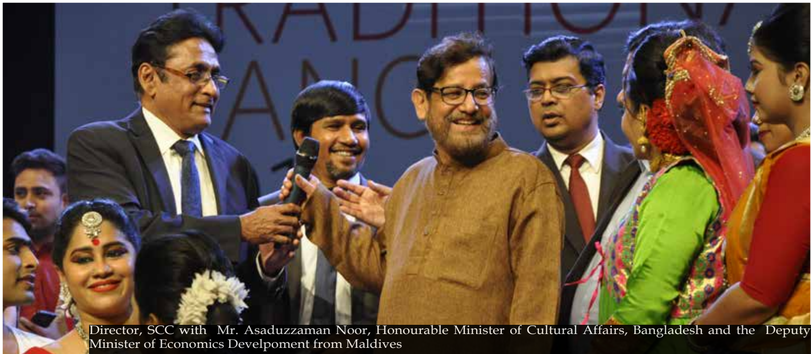
Director, SCC with Mr. Asaduzzaman Noor, Honourable Minister of Cultural Affairs, Bangladesh and the Deputy Minister of Economic Development from Maldives