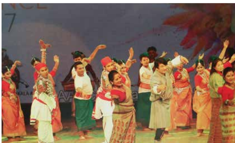
The Closing Ceremony - The "Combination Dance" with the participants from Bangladesh, Bhutan, India and Sri Lanka