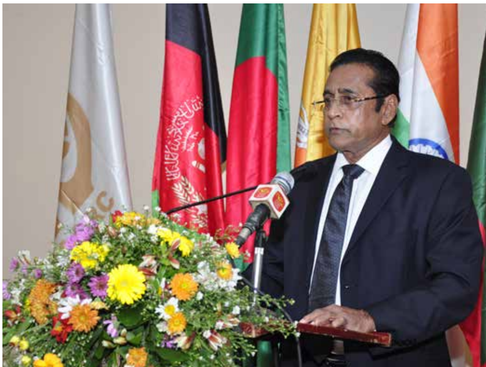
Welcome address by the Director of the SAARC Cultural Centre