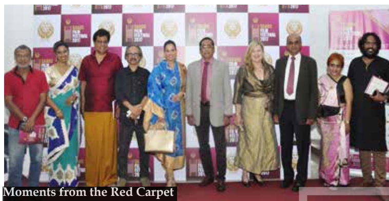
Moments from the Red Carpet