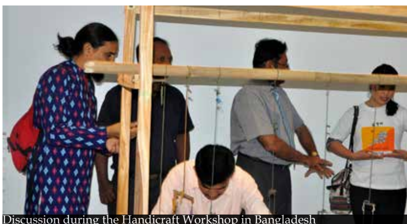
Discussion during the Handicraft Workshop in Bangladesh