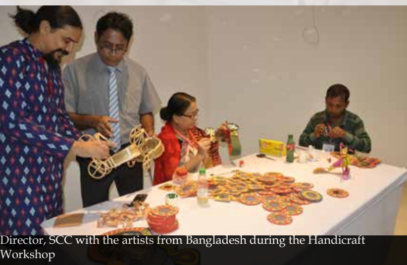
Director, SCC with the artists from Bangladesh during the Handicraft Workshop

2017. The Governments of Bangladesh, Bhutan, Maldives and Sri Lanka nominated teams of skilled Artisans - each individual an expert in his/her own individual craft - to participate in the SAARC Exhibition and Workshop on Handicrafts 2017. The opening of the Handicraft Exhibition took place on the 30 th November at the Jataya Chitrasala Plaza and enjoyed a steady stream of visitors until the closing of the Exhibition on the 3 rd December. There were handicrafts made of wood, metal, glass, coir,