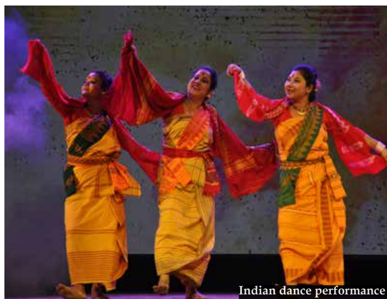
Indian dance performance

The Chief Guest for the Closing Ceremony, the Hon. Minister for Cultural Affairs Mr. Asaduzzaman Noor, attended the Ceremony on the 3 rd December held