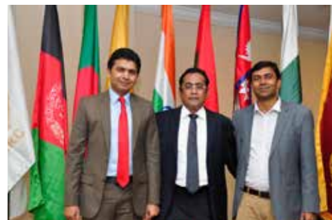
Director, SCC with the delegates from India and Pakistan