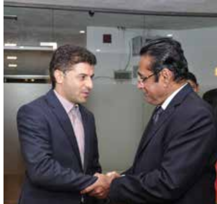
Director welcoming the representative from Iran