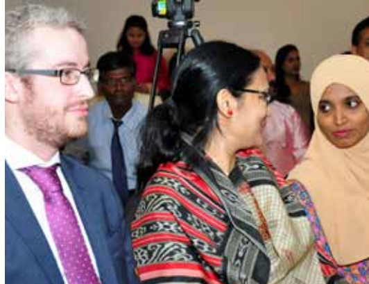
Representatives from Australian High Commission, Bangladesh High Commission and Embassy of Maldives