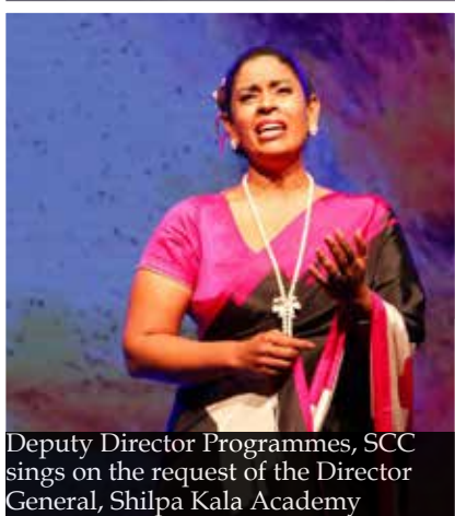
Deputy Director Programmes, SCC sings on the request of the Director General, Shilpa Kala Academy