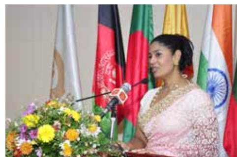
Deputy Director Programmes reading the message from the President of Sri Lanka