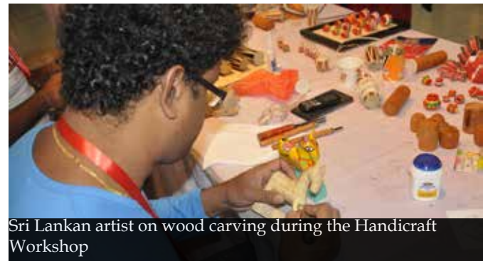
Sri Lankan artist on wood carving during the Handicraft Workshop

cork, cloth, stones, etc, which displayed a wide range of talent, skill and knowledge. This knowledge was especially valuable to the participants during the Workshop component of the Programme. There were extensive discussions and exchange of know-how and techniques amongst the delegates, as they shared their experiences and skills of their crafts in various parts of the South Asian Region.