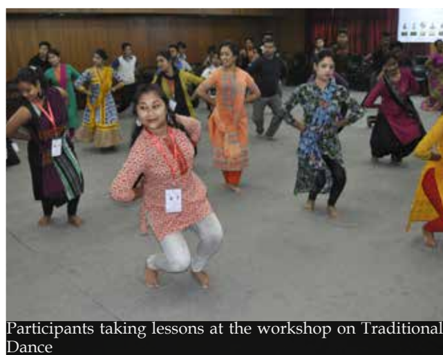
Participants taking lessons at the workshop on Traditional Dance

took place at the Nandanmoncho open air venue and the entire area was transformed for the evening. A traditional Lathi Khela dance of Bangladesh took place prior to the inauguration. The Inauguration itself was spectacular with a joyous and festive atmosphere; the open-air venue added a different dimension to the occasion. More than 3,000 people participated at the Inauguration Ceremony, which included men, women, the young and old from all walks of life, enjoying the Traditional Dance of the SAARC Region.