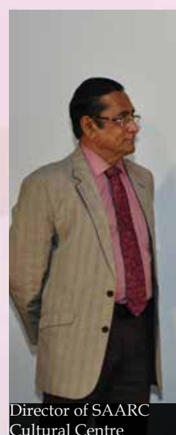
Director of SAARC Cultural Centre