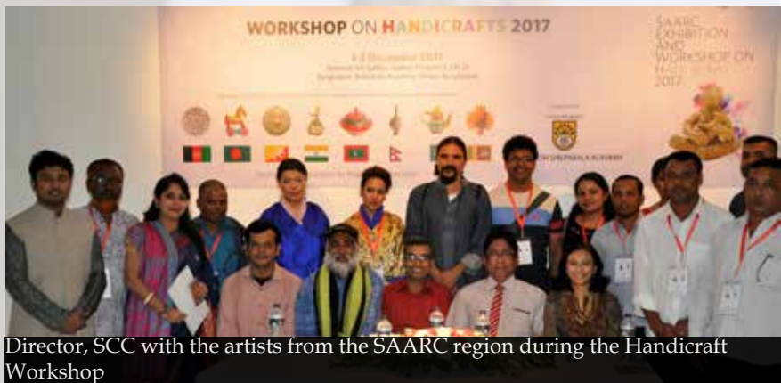
Director, SCC with the artists from the SAARC region during the Handicraft Workshop

2017. The Governments of Bangladesh, Bhutan, Maldives and Sri Lanka nominated teams of skilled Artisans - each individual an expert in his/her own individual craft - to participate in the SAARC Exhibition and Workshop on Handicrafts 2017. The opening of the Handicraft Exhibition took place on the 30 th November at the Jataya Chitrasala Plaza and enjoyed a steady stream of visitors until the closing of the Exhibition on the 3 rd December. There were handicrafts made of wood, metal, glass, coir,