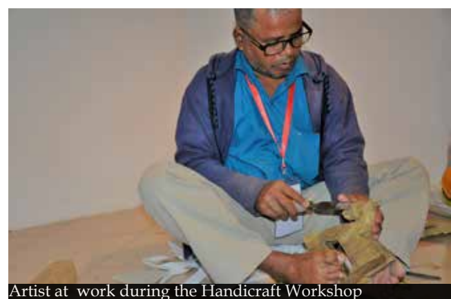
Artist at work during the Handicraft Workshop