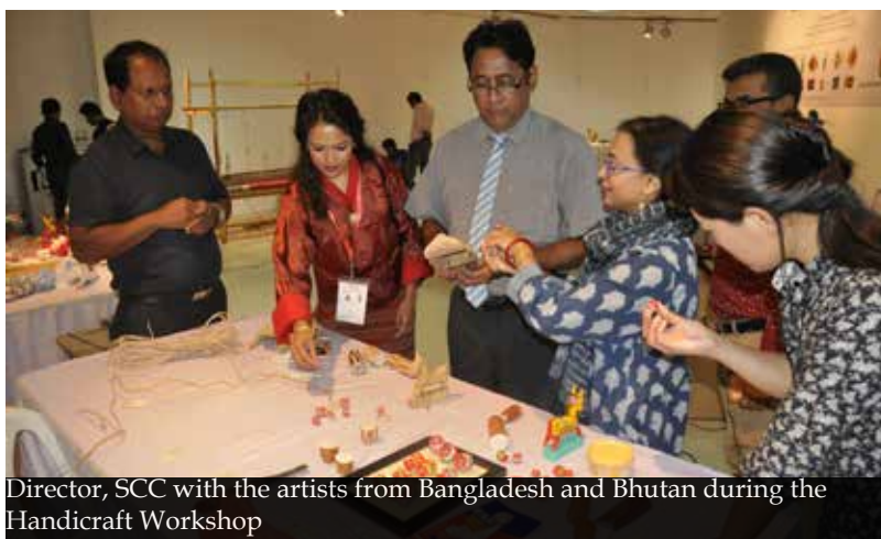
Director, SCC with the artists from Bangladesh and Bhutan during the Handicraft Workshop