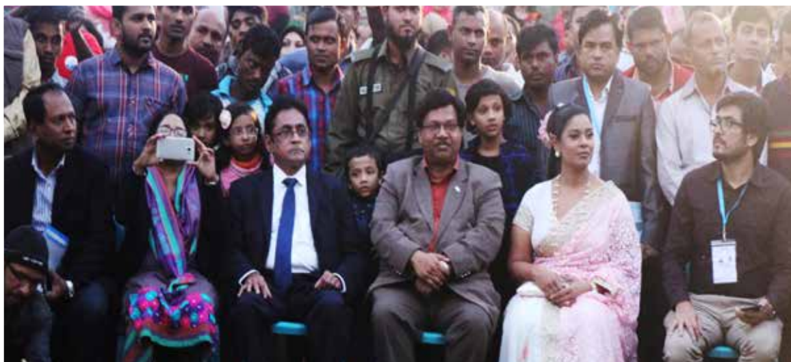
Seated from left to right