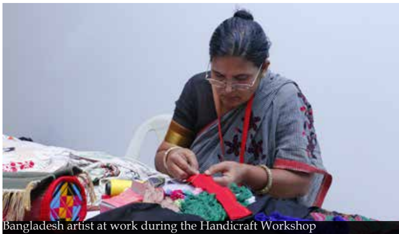
Bangladesh artist at work during the Handicraft Workshop