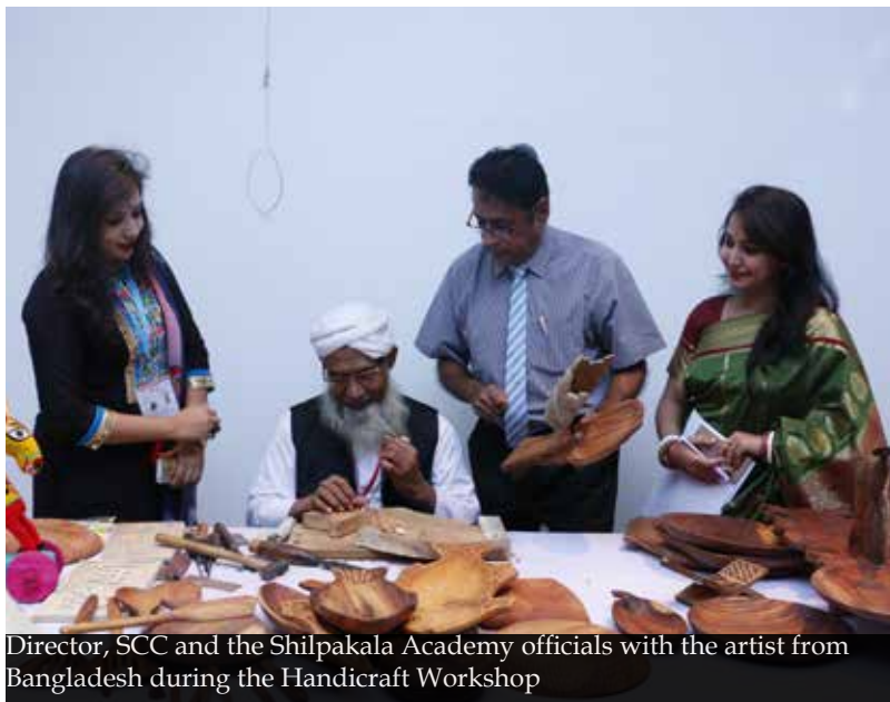
Director, SCC and the Shilpakala Academy officials with the artist from Bangladesh during the Handicraft Workshop

cork, cloth, stones, etc, which displayed a wide range of talent, skill and knowledge. This knowledge was especially valuable to the participants during the Workshop component of the Programme. There were extensive discussions and exchange of know-how and techniques amongst the delegates, as they shared their experiences and skills of their crafts in various parts of the South Asian Region.