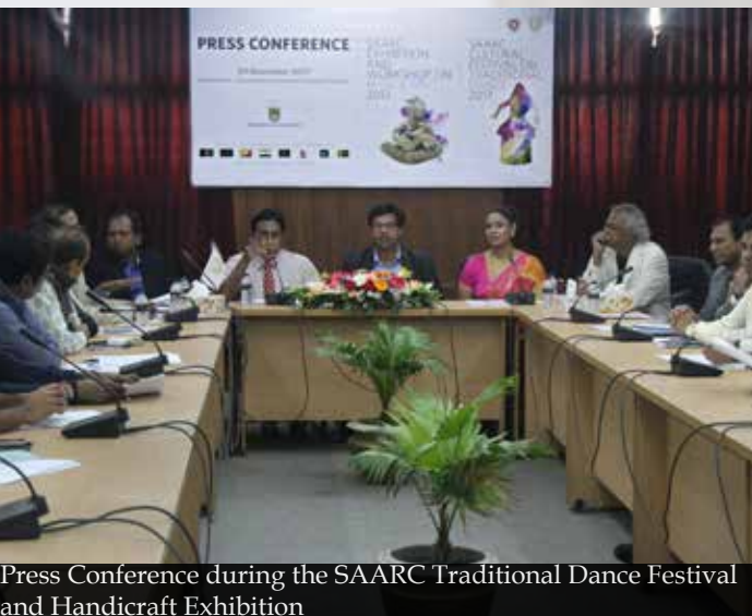
Press Conference during the SAARC Traditional Dance Festival and Handicraft Exhibition

The SAARC Exhibition and Workshop on Handicraft 2017 was organised in collaboration with the Bangladesh Shilpakala Academy and held in Dhaka, Bangladesh from the 30 th November to the 3 rd December