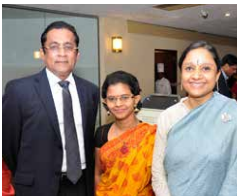
Director, SCC with the staff members of SAARC Cultural Centre