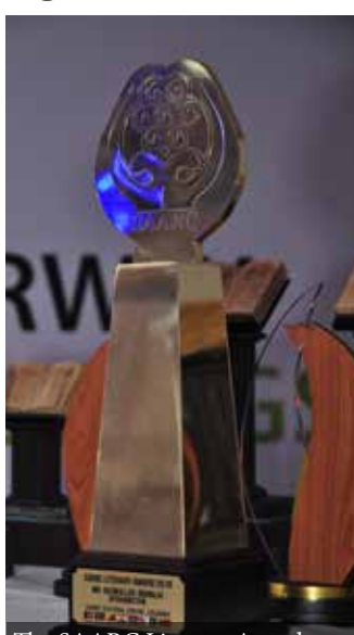
The SAARC Literary Award