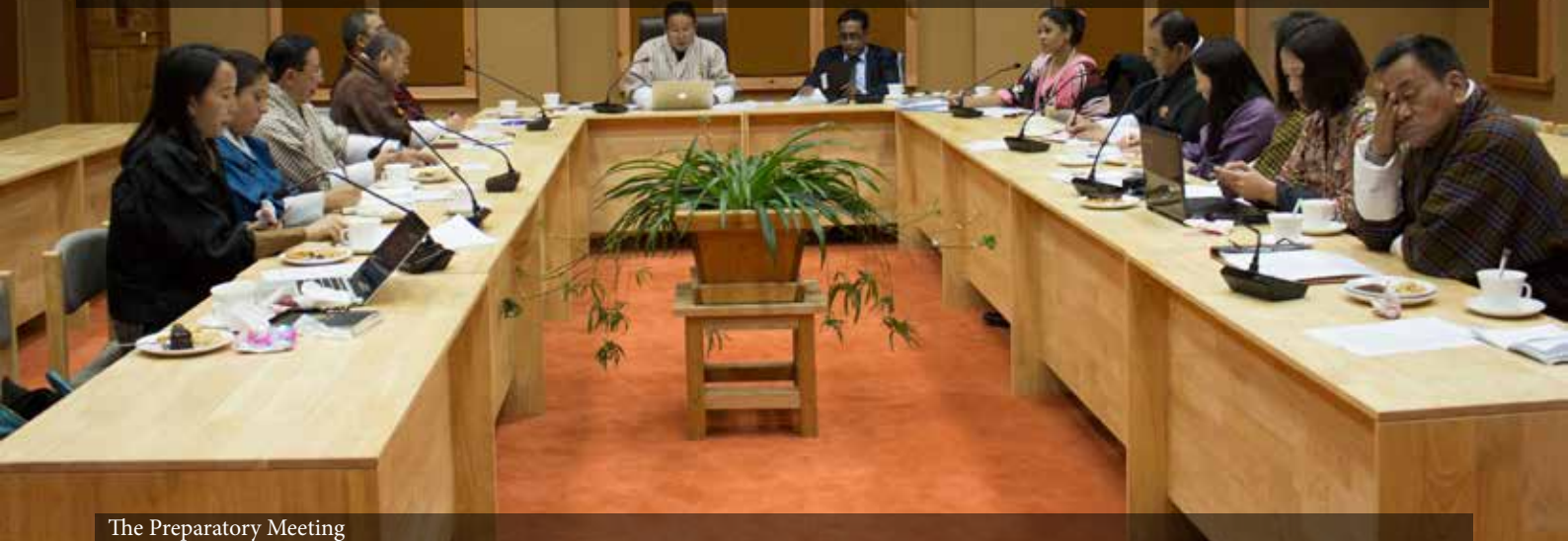
The Preparatory Meeting

12 th - 13 th February in Thimphu, Bhutan