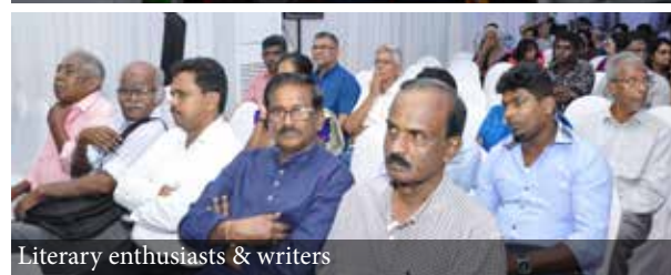
Literary enthusiasts & writers