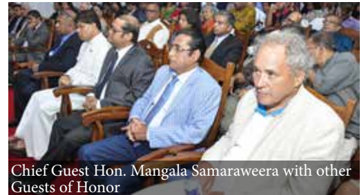
Chief Guest Hon. Mangala Samaraweera with other Guests of Honor

areas of literature in the Regional and International arenas. The SAARC Literary Award will be presented alphabetically to a writer from each Member State, commencing with Afghanistan for 2018.