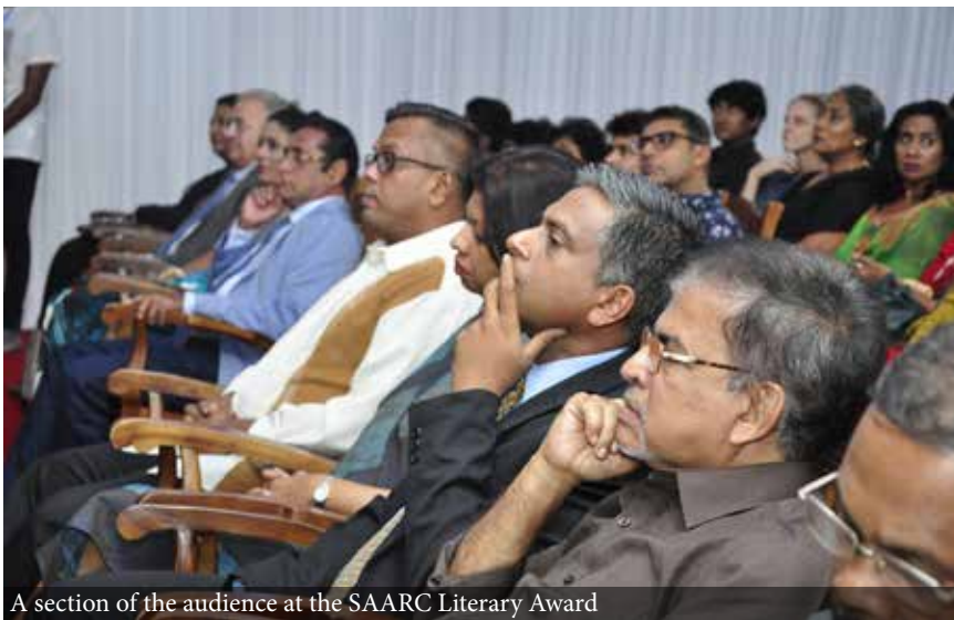
A section of the audience at the SAARC Literary Award