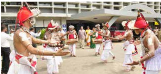
Traditional drummers & dancers ceremonially leading the Chief Guest & Guests of Honor to the Auditorium