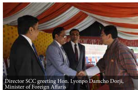
Director SCC greeting Hon. Lyonpo Damcho Dorji, Minister of Foreign Affairs