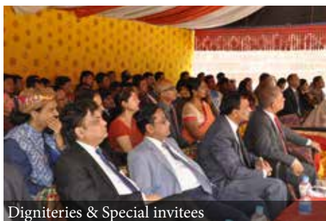
Dignitaries & Special invitees