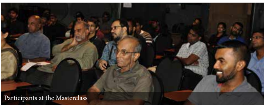
Participants at the Masterclass