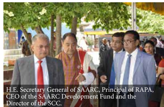
H.E. Secretary General of SAARC, Principal of RAPA, CEO of the SAARC Development Fund and the Director of the SCC.