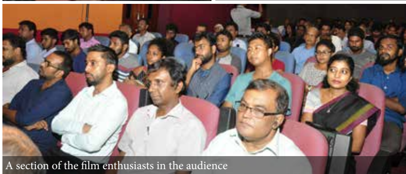
A section of the film enthusiasts in the audience