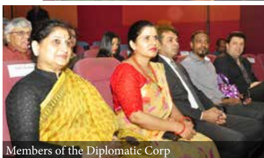
Members of the Diplomatic Corp