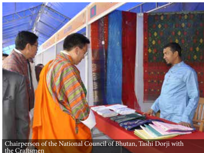
Chairperson of the National Council of Bhutan, Tashi Dorji with the Craftsmen