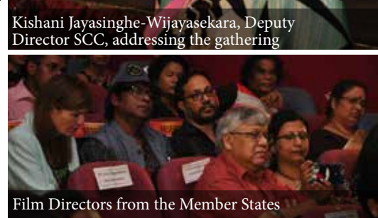
Film Directors from the Member States