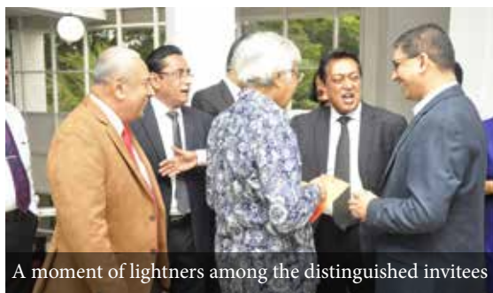
A moment of lighters among the distinguished invitees