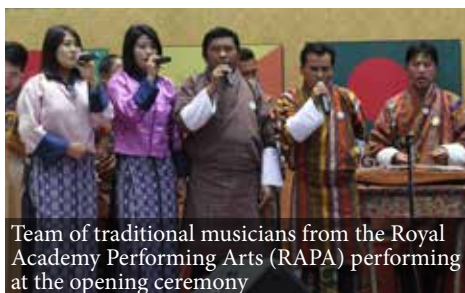
Team of traditional musicians from the Royal Academy Performing Arts (RAPA) performing at the opening ceremony