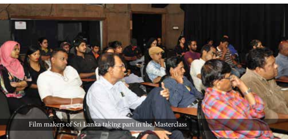
Film makers of Sri Lanka taking part in the Masterclass