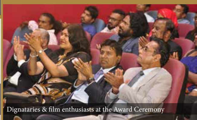
Dignitaries & film enthusiasts at the Award Ceremony