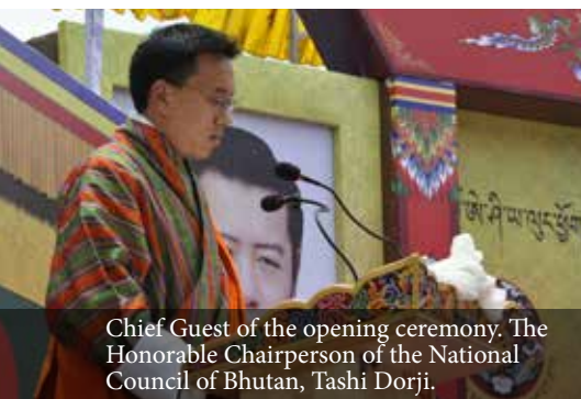
Chief Guest of the opening ceremony. The Honorable Chairperson of the National Council of Bhutan, Tashi Dorji.