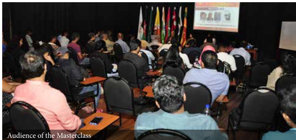
Audience of the Masterclass