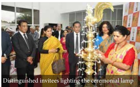
Distinguished invitees lighting the ceremonial lamp