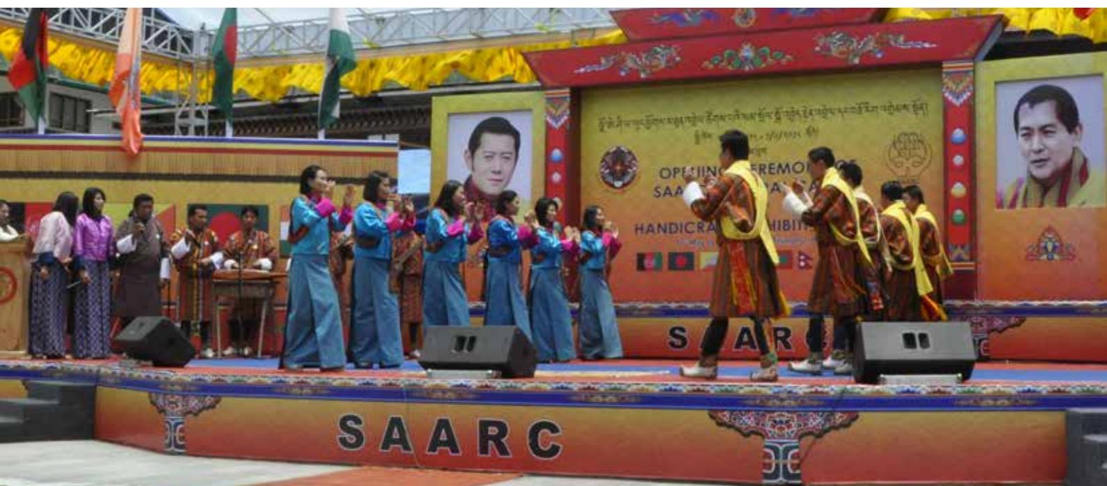
Traditional dance from Bhutan by artists from RAPA