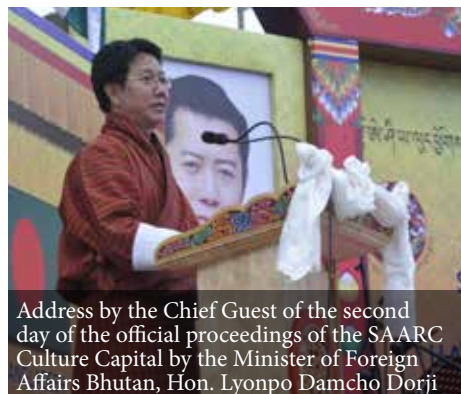
Address by the Chief Guest of the second day of the official proceedings of the SAARC Culture Capital by the Minister of Foreign Affairs Bhutan, Hon. Lyonpo Damcho Dorji