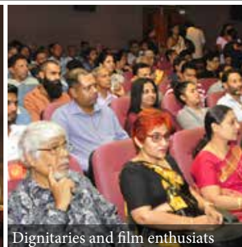
Dignitaries and film enthusiasts