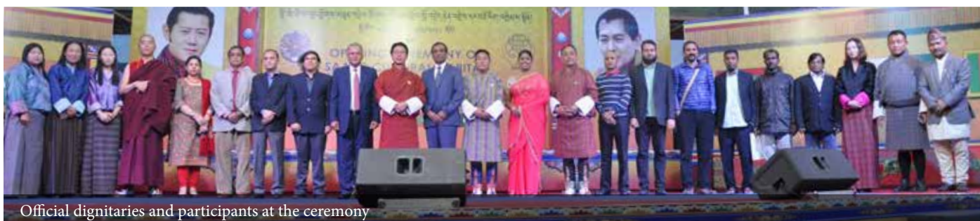
Official dignitaries and participants at the ceremony