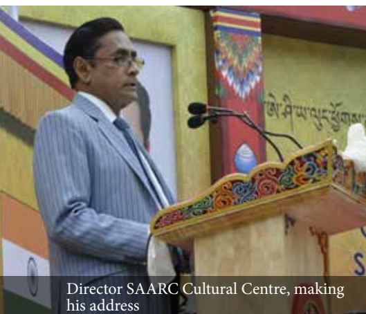
Director SAARC Cultural Centre, making his address