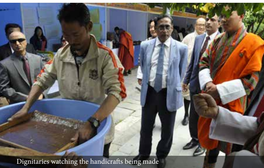
Dignitaries watching the handicrafts being made

The handicraft stalls were presented around the Thimphu City Centre Clock Tower amidst the celebrations of the SAARC Culture Capital. The SAARC Handicrafts