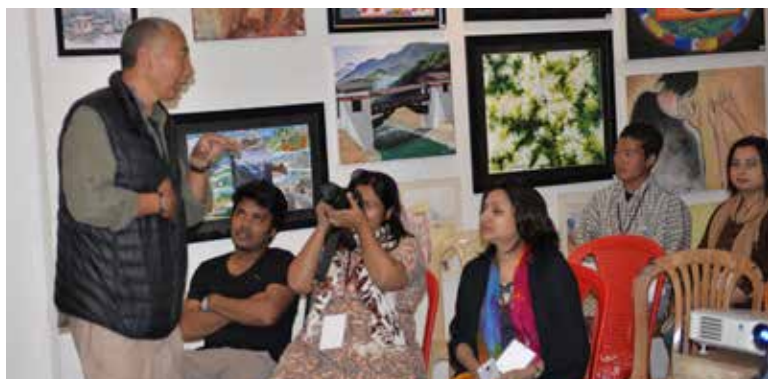
SAARC Artists Camp - Over the years... 2011, 2012, 2013, 2014, 2015, 2016, 2017