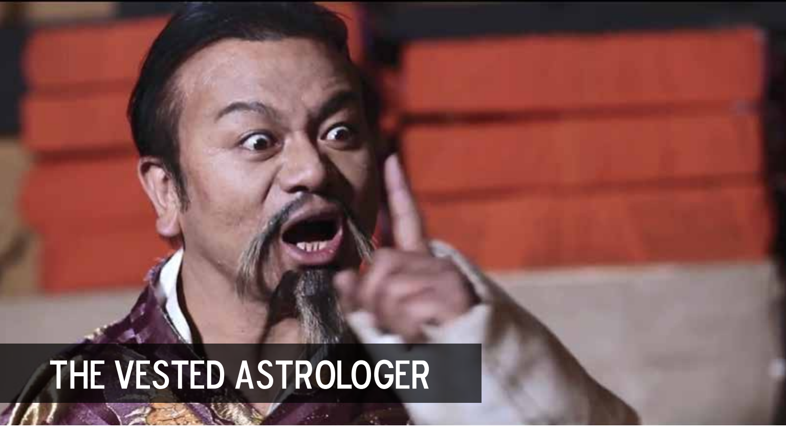
Feature/ 135 mins/ Bhutan