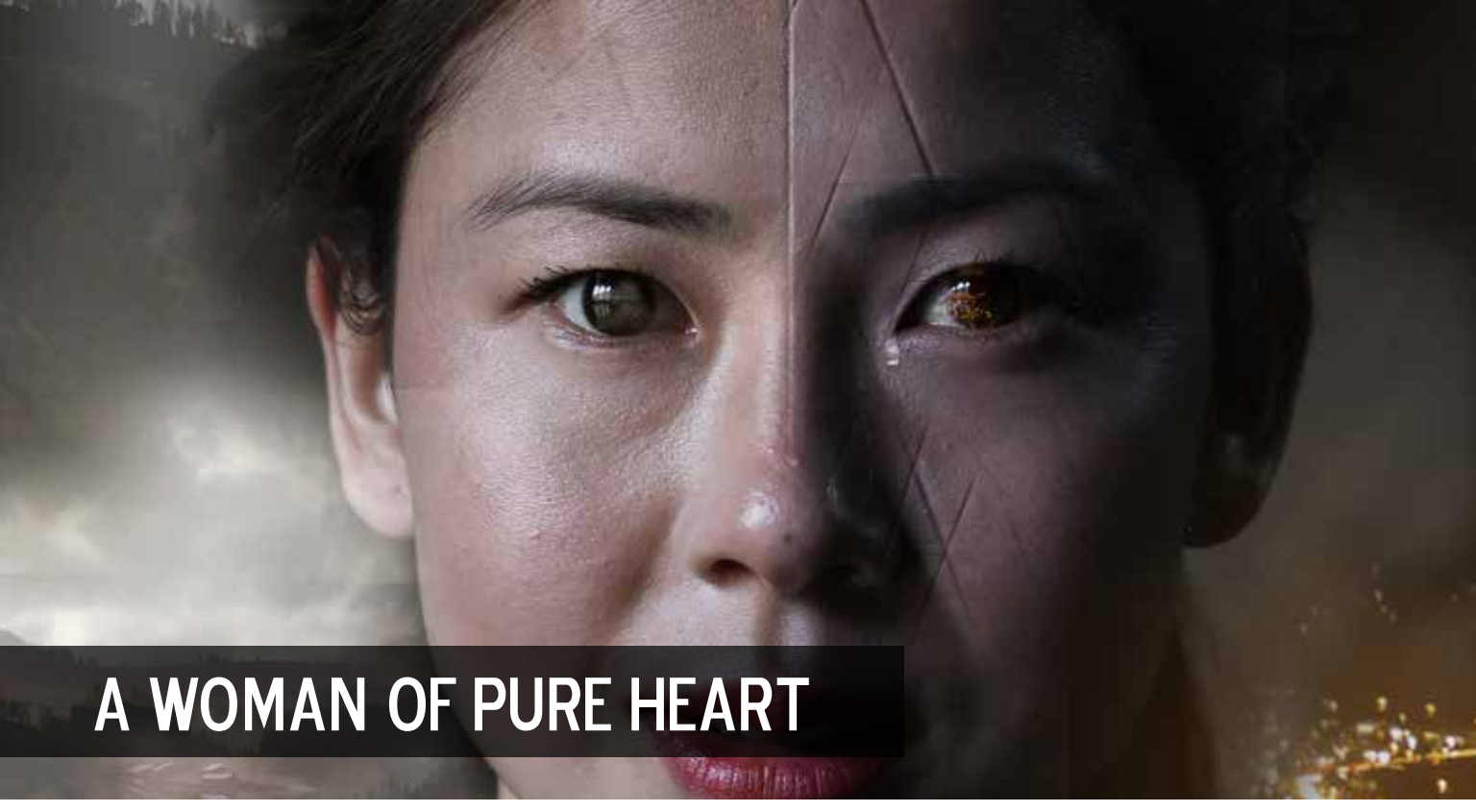
Short/ 24 mins/ Bhutan