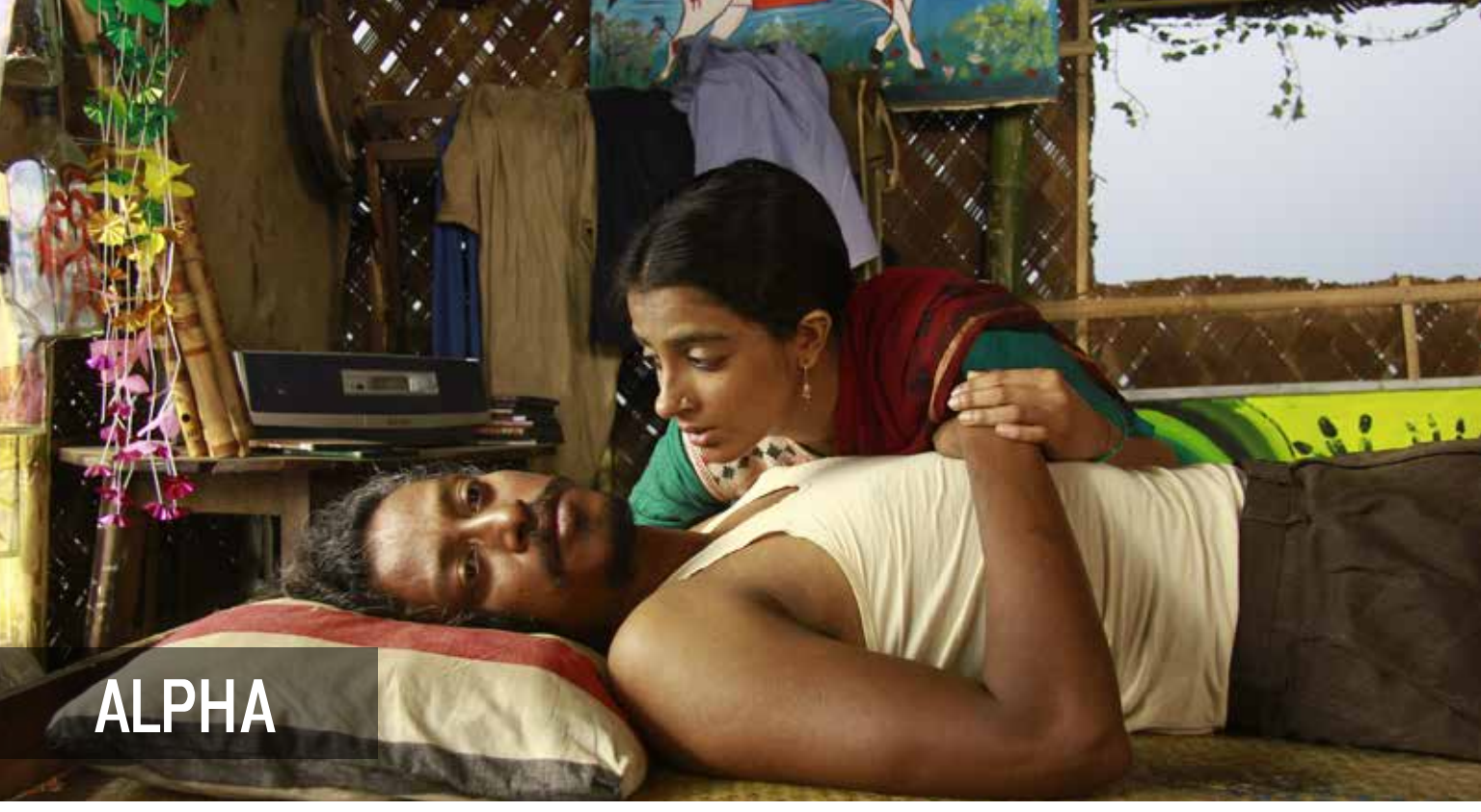
Master/ 87 mins/ Bangladesh