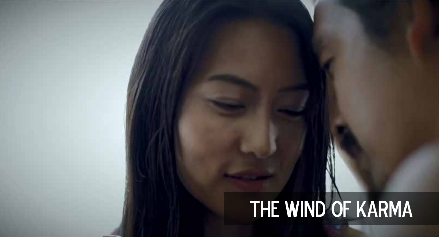
Feature/ 67 mins/ Bhutan