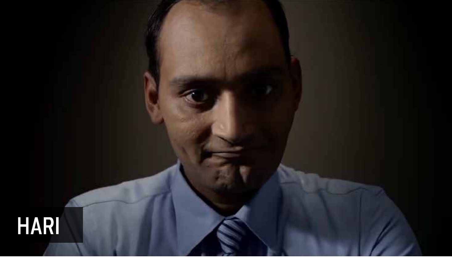
Master/ 106 mins/ Nepal

The story follows a thirty- year old overly religious and superstitious man-child named Hari. He has led his whole life following the rules that were set by his ancestors and his strict religious widow mother. Leading a monotonous life at home and office. His life takes a sudden change when one day a bird craps on him, to his dismay he doesn't know if it is a pigeon which is a sign of good luck or a crow which happens to be a bad omen. As his day continues, he experiences both good and bad, which confuses Hari. All these events start to veer Hari onto a new path where he finds love and desires, he didn't know he had before. Hari is a man who hasn't ever thought for himself but rather just obeyed everything that was told by his mother, his boss, his staff and everyone in his life but as events unfold Hari takes a stand and takes chances and savors his freedom. All this however comes with a price, as the good, will always come with the bad.