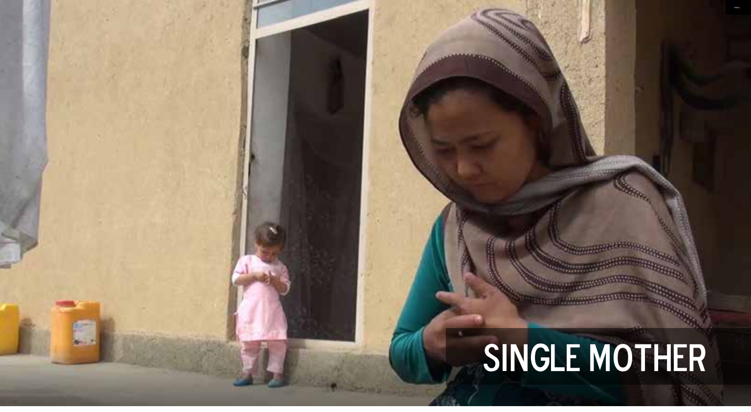
Short/ 20 mins/ Afghanistan