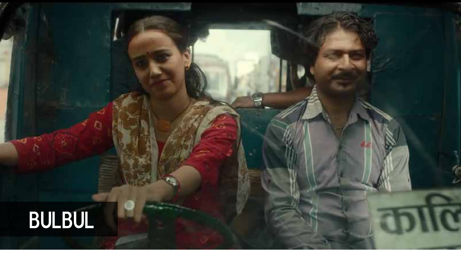
Feature/ 127 mins/ Nepal

From the psychoanalytic perspective, this is the story of unmet desires and other pertaining core issues. When the protagonist's husband goes to the Gulf leaving his wife along with his paralysed father and infant daughter, the strongest support of her life also goes away. While she continues hoping that he comes back one day, the hope gradually fades after he stops sending money around two years later. Day by day, the frequency of his phone calls wanes, and this makes the woman increasingly feel abandoned and betrayed. Also contributing to her fear is her workplace where a colleague abuses her. These circumstances collectively lead her to an unconscious desire for a 'substitute', which she later finds in a random guy wandering around her station. But, as psychoanalytic theorists say, the unconscious, the storehouse of unfulfilled desires, never dies; hence nothing or no one can quench people's desire for the original source of happiness.