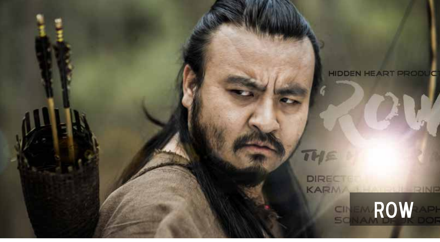
Short/ 8 mins/ Bhutan