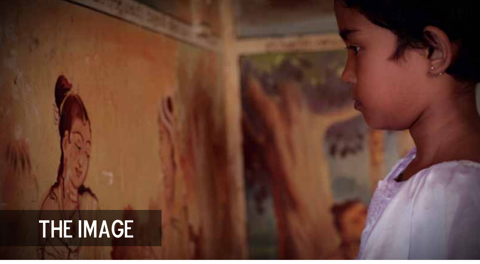
Short/ 8 mins/ Sri Lanka

There is a little girl who has no idea about nationalism or religion. She always has a question about everything. When she saw the reliquary for the first time in her life, she had no idea about that too. So, she put questions to her grandmother and she understands the value of that. And also, she gets an understanding of the fact someone who is holding the reliquary, gets merit too. She thinks when she grows up, she can also get merit like her father did. But, her grandmother says that, it is prohibited to hold reliquary on a woman's head. What is the reason..? She fails to understand that. She continues to think about it always. Following which one day she saw the image on the temple wall which answered her question. This is the story about "her".