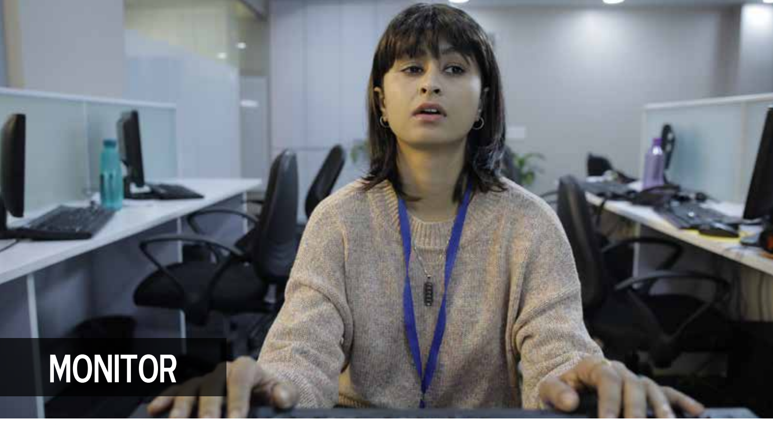
Short/ 20 mins/ India