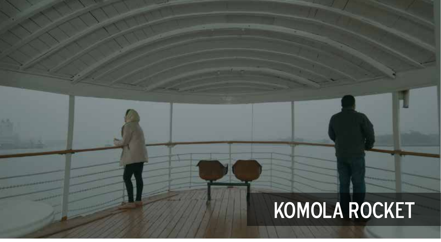
Feature/ 95 mins/ Bangladesh