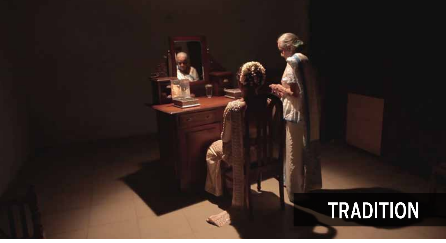
Short/ 11 mins/ Sri Lanka