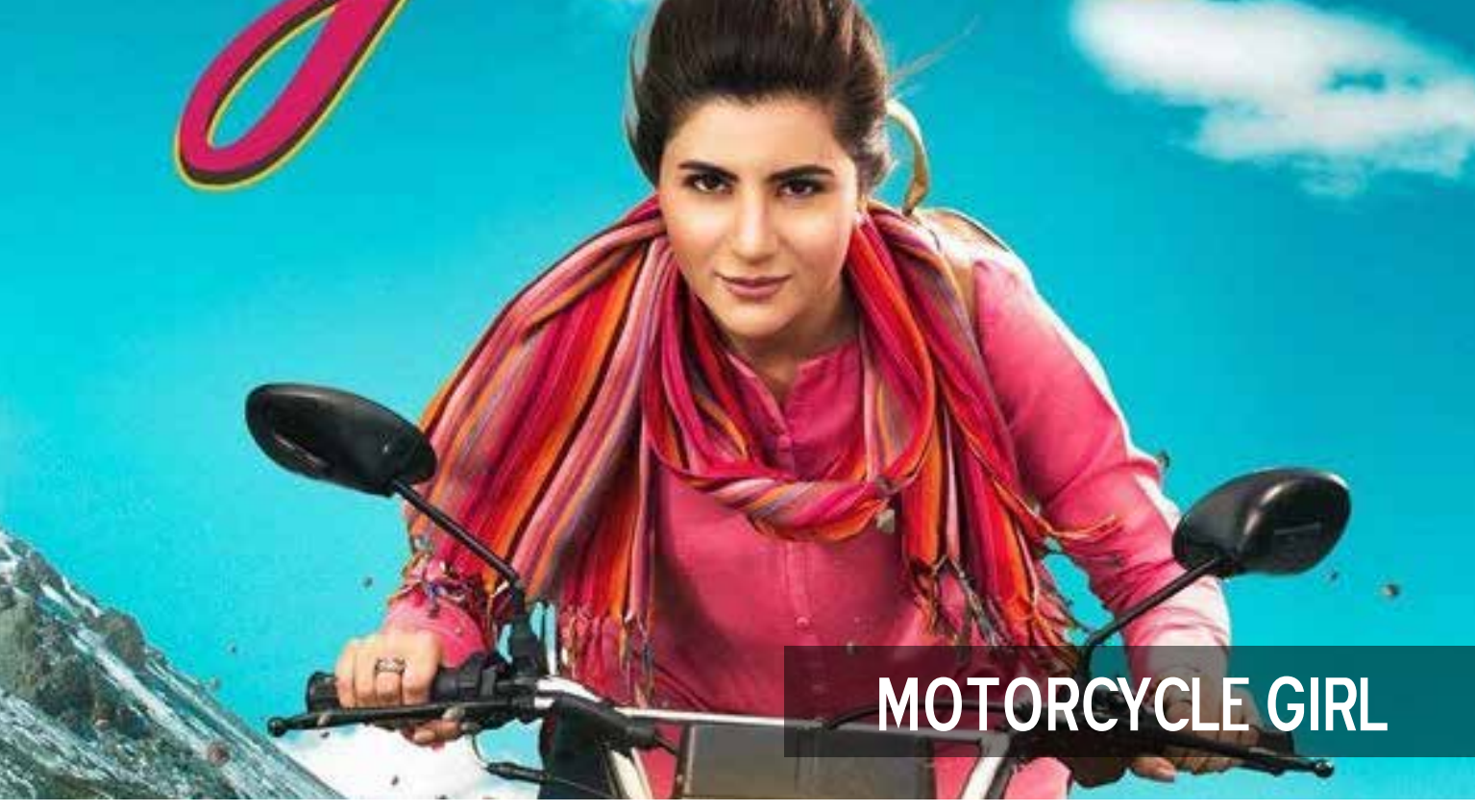
Feature/ 114 mins/ Pakistan