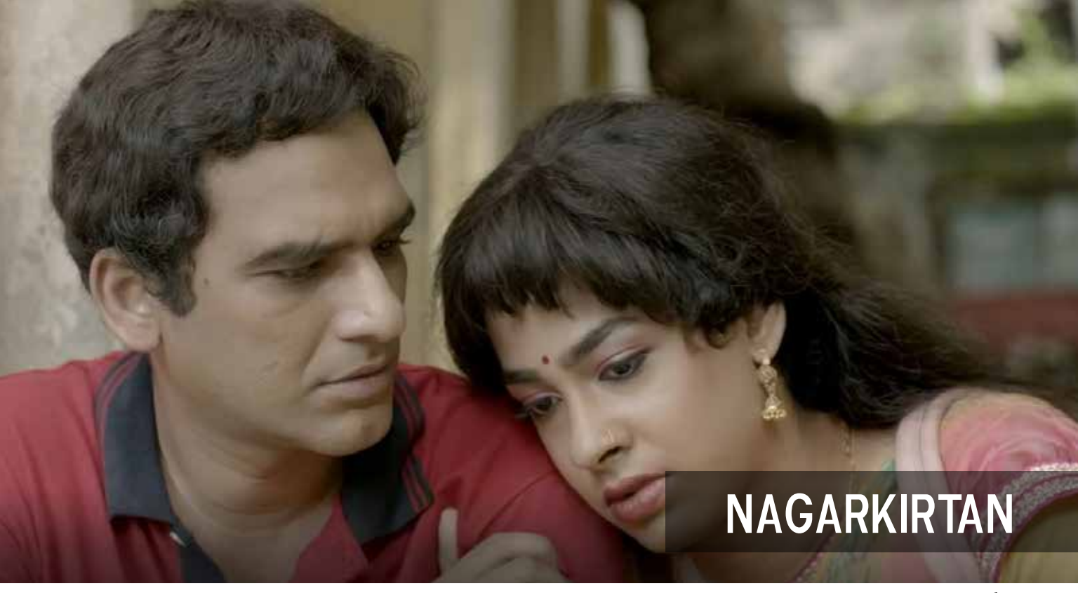
Feature/ 120 mins/ India