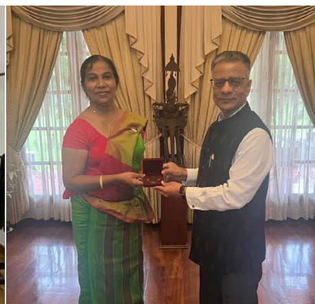
H.E. Gopal Bagley, High Commissioner of India to Sri Lanka