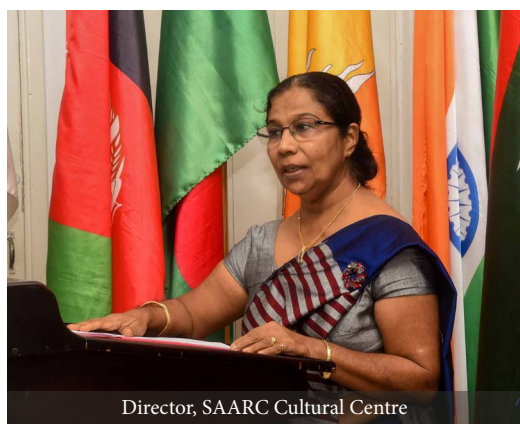
Director, SAARC Cultural Centre