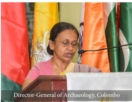
Director-General of Archaeology, Colombo