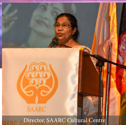
Director, SAARC Cultural Centre