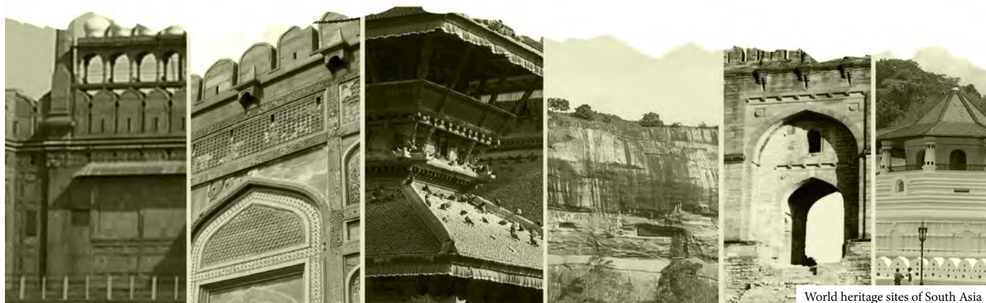
World heritage sites of South Asia