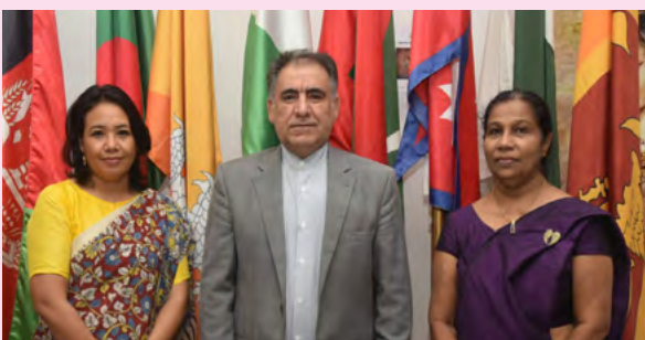
Deputy Director-Research, SCC, Cultural Counsellor, Iran Cultural Centre and the Director, SCC