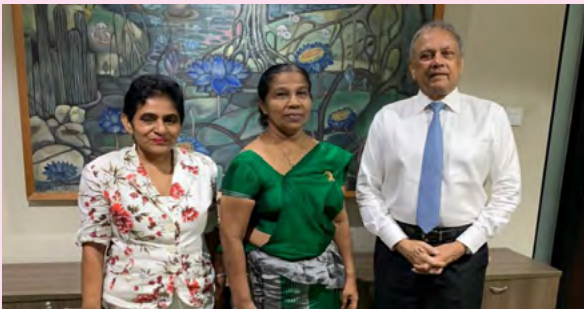
Director, SCC and the Deputy Director-Programmes with the Honorary Consul of Bhutan in Sri Lanka