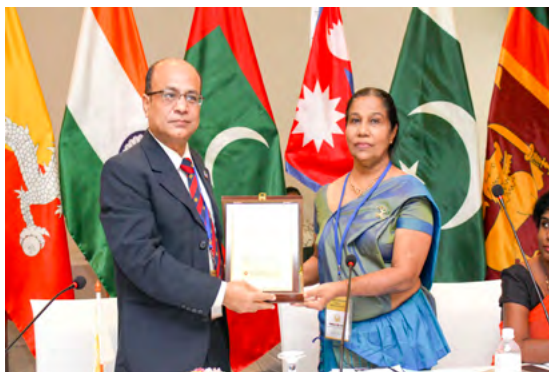
Director SCC presenting the memento to the Chairperson of the 13 th Governing Board