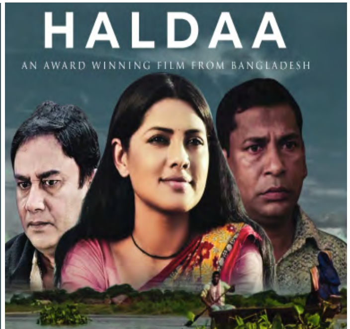
Screening of “Haldaa” from Bangladesh