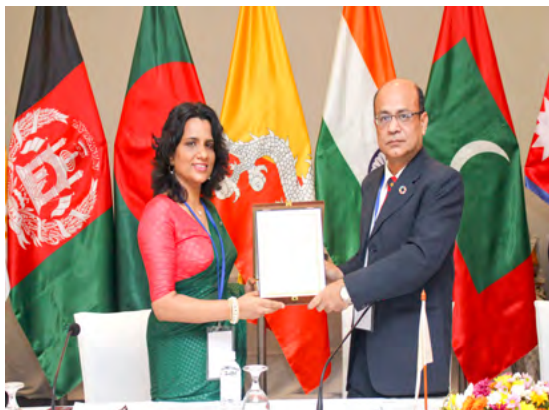
Chairperson of the 13 th Governing Board & Director, ESC