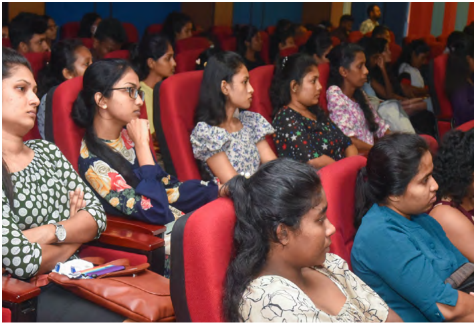
A section of the audience