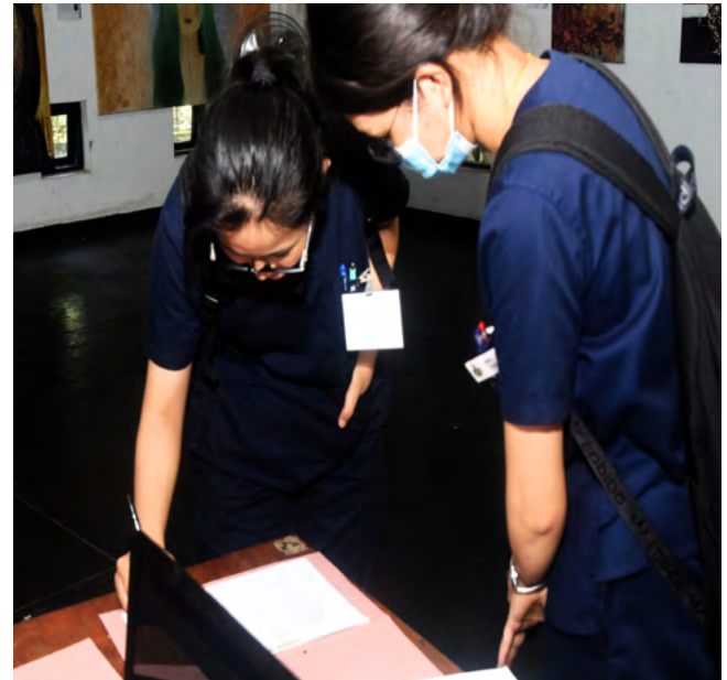
Bhutanese students in Sri Lanka at the Registration Desk