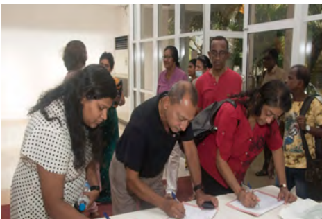
Film enthusiasts at the Registration Desk