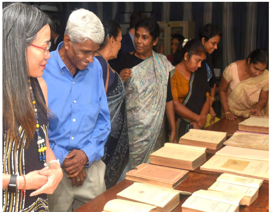
Distinguished guests appraising the rarebooks of RASSL