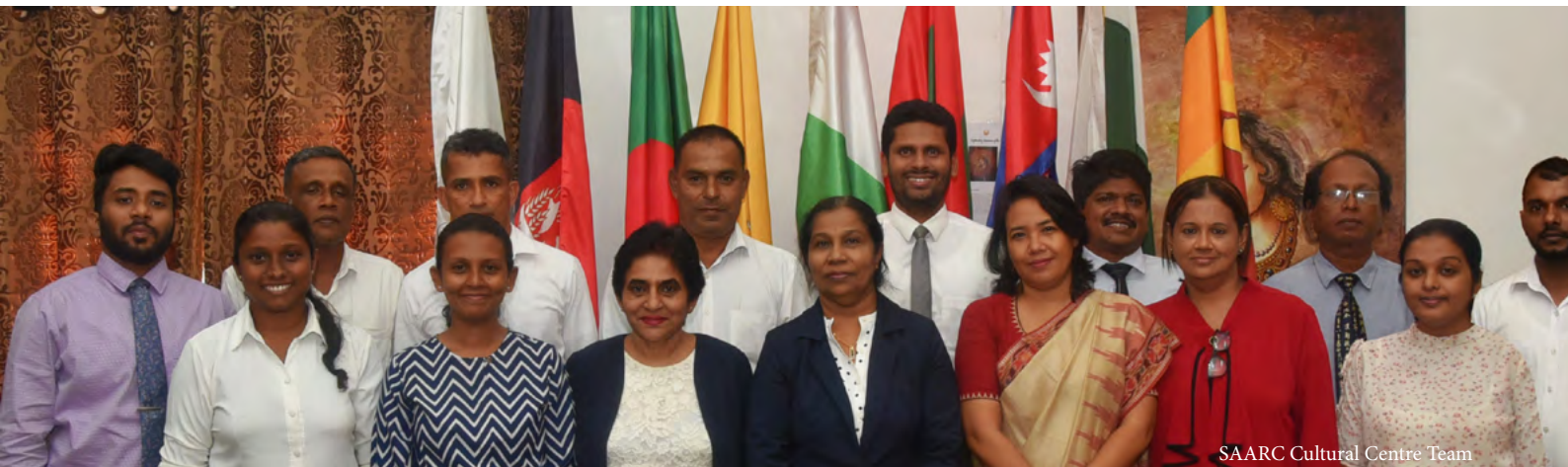
SAARC Cultural Centre Team