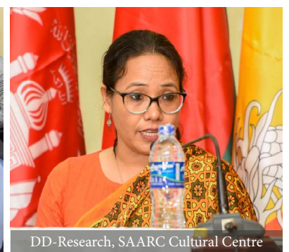
DD-Research, SAARC Cultural Centre