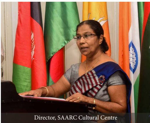
Director, SAARC Cultural Centre