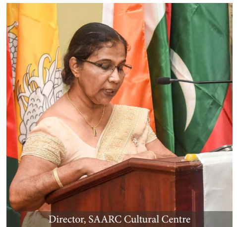
Director, SAARC Cultural Centre