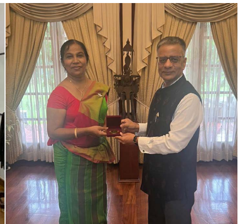
H.E. Gopal Bagley, High Commissioner of India to Sri Lanka