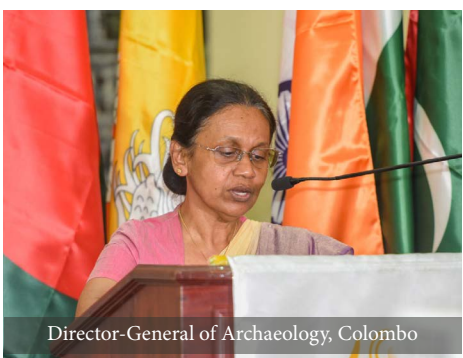
Director-General of Archaeology, Colombo